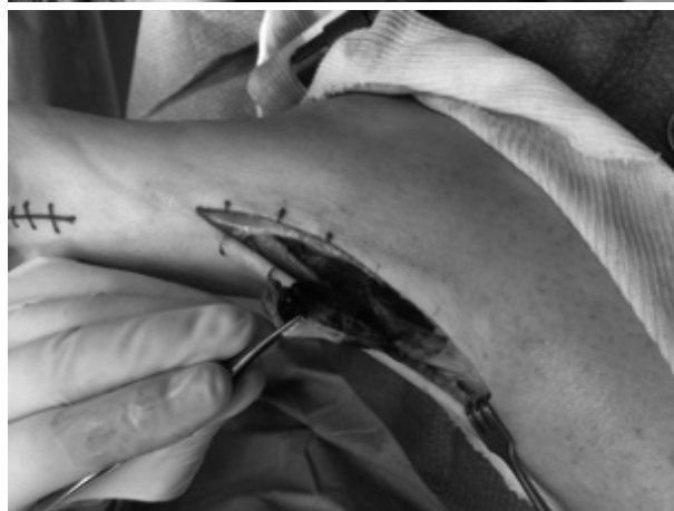
Figure 2. — Incision of the skin.

opinion and revealed a complete rupture of the TA tendon with significant retraction.