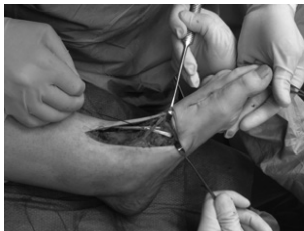
Figure 5. — Section of the Extensor Hallucis Longus.