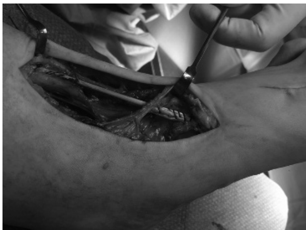
Figure 6. — The EHL and TA are sutured proximally and the EHL graft is passed in the transosseous tunnel and sutured on itself.

into the transosseous tunnel and sutured on itself (Figure 6). Achilles tendon or gastrocnemius release was not necessary during tendon tensioning.