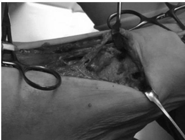
Figure 3. — Identification of the ruptured tendon.