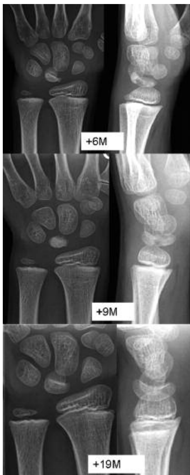
Fig. 3. — Long-term evolution. Radiograph after 6 and 9 months of follow-up showed signs of revascularization. At 19 months, the lunate is fully vascularized and has a normal shape.