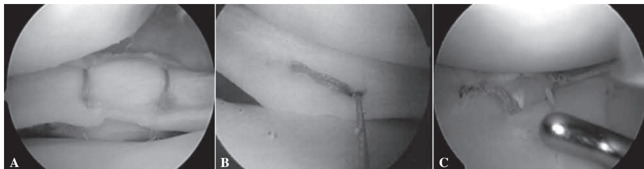
Fig. 1. — Intraoperative arthroscopic views. (A) Vertical mattress suture configuration. (B) Horizontal mattress suture configuration. (C) Vertical and oblique mattress suture configuration.

If the patient had a concomitant ACL injury, arthroscopic reconstruction was conducted immediately after the meniscal repair.