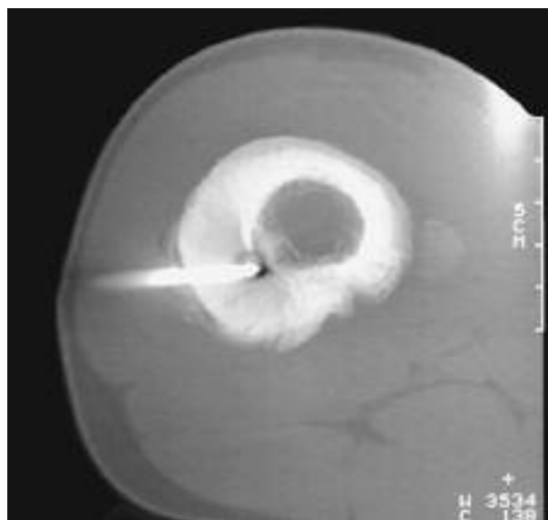
Fig. 2. — End of guide-wire inside the nidus, around which we introduce a radiofrequency guide.

At present, radiofrequency has also been used to treat other bone lesions such as bone metastasis, sacrum chordoma, and others (26).