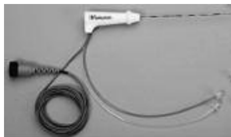
Fig. 3. — Cool-tip RF System electrode

All patients reported complete pain relief, except one who felt persisting discomfort in his thigh. This patient presented a major cortical reaction in the femur after the radiofrequency procedure. In the end he underwent open surgery with en bloc resection of the cortical bone affected, which