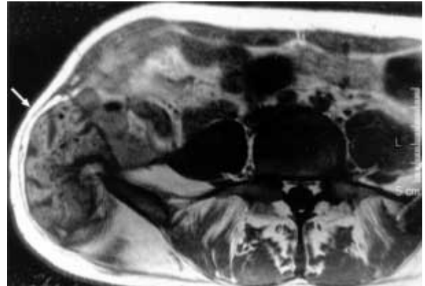
Fig. 5. — Transverse view T1, showing herniation of the abdominal wall, avulsion from the right iliac crest of the internal and external oblique and transverse abdominal muscle and herniated segment of the colon (white arrows show hernia).

Although intra-abdominal lesions after blunt abdominal trauma are a fairly common occurrence, traumatic herniation of the abdominal wall is a relatively rare entity (2, 4-8). Several different mechanisms of traumatic herniation of the abdominal wall have been described. As mentioned by Damschen et al. (4) and others (1, 10), one known mechanism in patients involved in car crashes and wearing lap belts is a shearing force that passes over the iliac crest, thus causing avulsion of the muscles from their insertions in the pelvis. This is the so-called seatbelt hernia. Another known mechanism is a direct blow to the abdominal wall by a small object like a handlebar (3, 4, 8, 11) or a