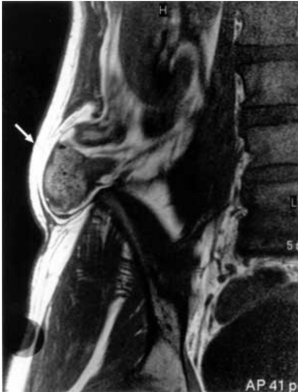
Fig. 4. — MRI 4 months postinjury, frontal view

To further protect our fixation we also used a supplementary prosthetic mesh. The 18 mo. postoperative follow-up was uneventful, and the patient has remained asymptomatic.