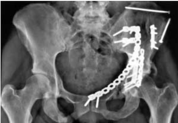
Fig. 2. — Postoperative x-ray of the pelvis

Surgical treatment of the pelvic and acetabular fracture was postponed until the twelfth day after admission owing to pulmonary fat embolism. At that time an open reduction and internal fixation of the iliac wing fracture and the acetabular fracture was done using a combined ilio-inguinal (Letournel) and a Kocher-Langenbeck posterior approach (fig. 2). During follow-up there were no complications of the left-sided pelvic and acetabular fractures and the bladder lesion. Postoperatively a mass the size of a grapefruit could be felt on the right-sided iliac crest without any other clinical findings. This was associated with discomfort and mild pain. The mass was thought to be a hematoma, and no CT-scan was done nor was there a correct interpretation of the initial abdominal CT-scan (fig. 3).