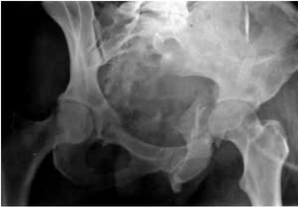
Fig. 1. — Preoperative x-ray of the pelvis showing an AO type C-3 fracture.