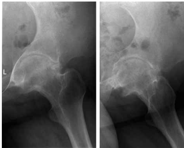
Fig. 1. — Radiograph of the left hip on admission in our institution, showing severe destructive arthritis of the left hip. The articular cartilage has almost vanished and there are signs of severe destruction of the subchondral bone.

Four months later, the girl returned to the same orthopaedic surgeon. Since the first contact there had not been any improvement of the pain. Physical examination showed a positive Trendelenburg sign. Radiographic findings included narrowing of the left coxofemoral joint space and protrusio acetabuli. A Technetium bone scan showed increased isotope uptake over the left hip joint. In addition a nuclear magnetic resonance scan was performed. This showed a considerable amount of fluid in the left coxofemoral joint space and oedema of both femoral head and acetabulum. The treatment was not altered.