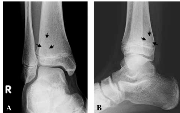
Fig. 2. — Postero-anterior and lateral radiograph of the patient's right ankle just after admission to the hospital and 4 weeks after temporary pain, swelling and erythema of the ankle is shown. The radiograph shows a subtle but circumscribed radiolucent lesion of the lateral (A) and dorsal (B) aspect of the metaphysis.

As the back pain worsened, the patient was presented at the nearby hospital. After work-up including an MRI of the spine, there was still uncertainty about the diagnosis; he was therefore referred to our tertiary centre. At presentation we saw a healthy patient with a temperature of 37°C. The physical findings were completely normal as were the findings at neurological examination. The pain of the right ankle had subsided and there was no swelling or tenderness.