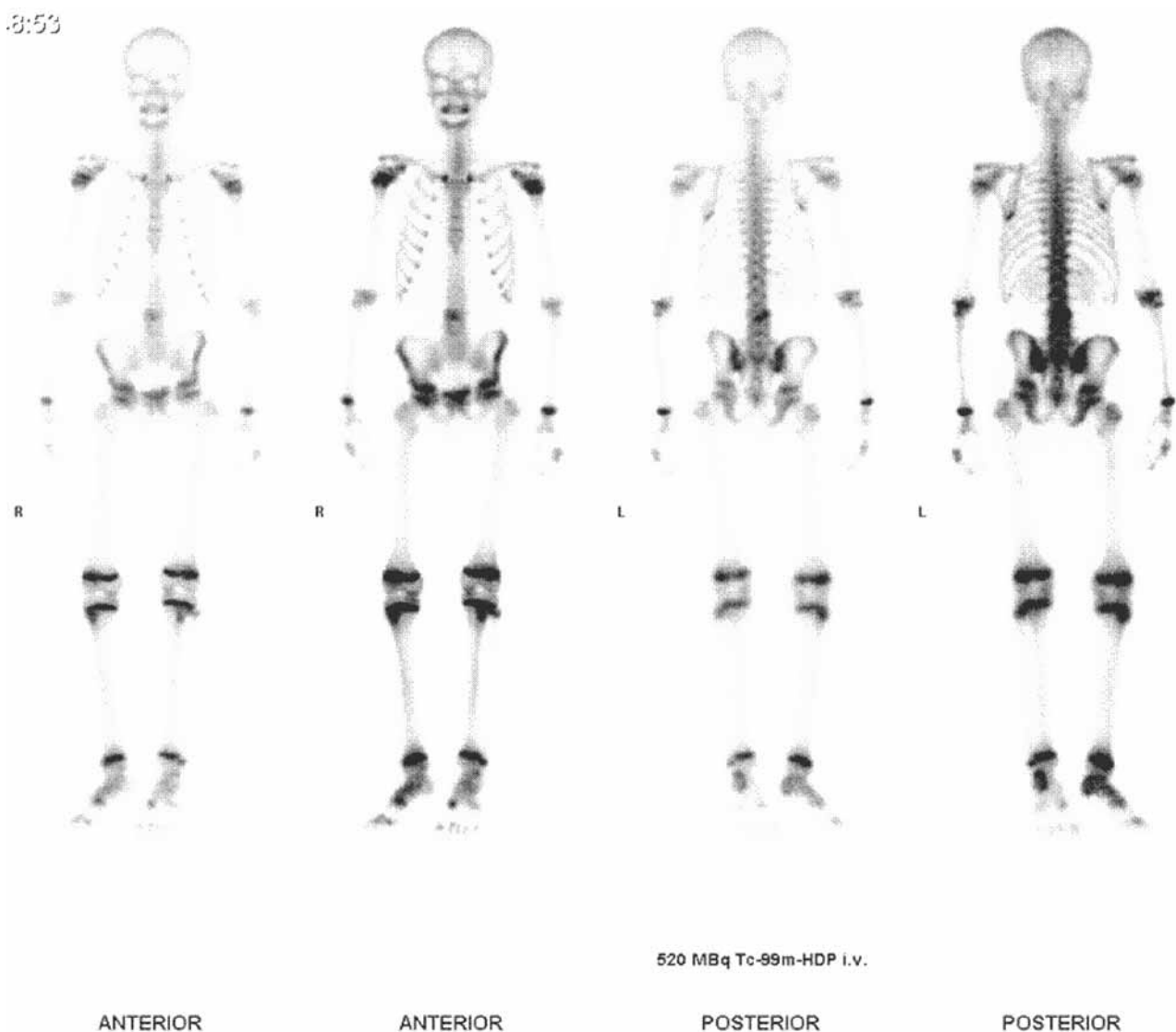
Fig. 3. — Whole body Technetium 99m scan revealed a distinct localised increased isotope uptake at one specific lumbar level in the mineral phase, both on the ventral and dorsal views.

directly thereafter treatment was started with intravenous antibiotics, bed rest and a body cast for comfort. After 7 days the CRP had fallen, all symptoms had disappeared and the patient was discharged from the hospital. Antibiotics were continued orally for an additional 5 weeks.