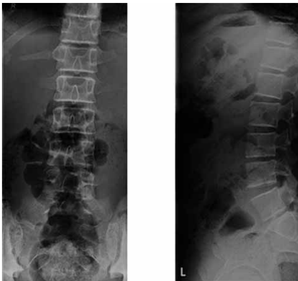
Fig. 5. — A postero-anterior and lateral lumbosacral spine film 10 weeks after onset of low back pain and 6 weeks after initiation of antibiotic treatment is shown. Note the loss of disk height at the L3-4 level.

discriminate. Helpful parameters in diagnosing spondylitis were age (> 3 years), fever, positive blood cultures (with non-contaminants) and lack of radiographic changes at initial presentation.