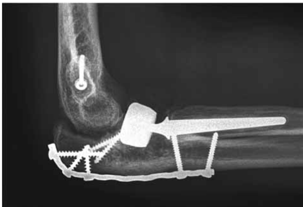
Fig. 3. — Lateral postoperative radiograph of a complex elbow reconstruction following trauma. The radial head was replaced with a 'floating radial head prosthesis' (Tornier SA, Saint-Ismier, France).

arm was still in a long arm cast. Another concern was degeneration and collapse of the graft that was found in follow-up radiographs (82). No long-term results were published.