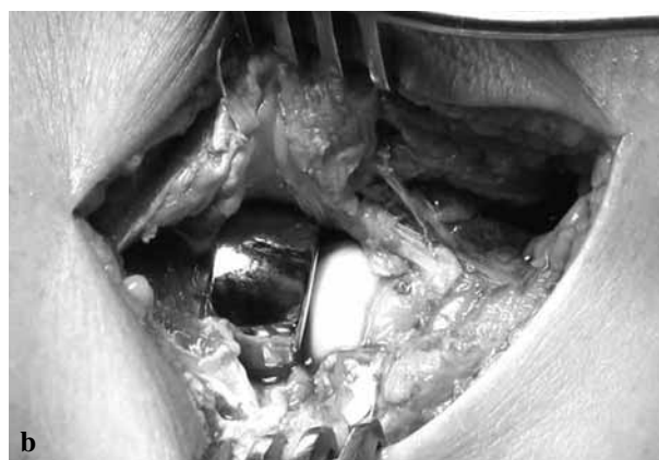
Fig. 4. — a) Modular radial head replacement (Evolve, Wright Medical Technology Inc., Arlington, TN, USA). Head and stem sizes can be determined individually and prosthetic components are interchangeable to accommodate the anatomy ; b) Evolve radial head prosthesis 'in situ'.

The first long-term results of a 'monoblock' metal radial head prosthesis (Smith & Nephew, Inc., Memphis, TN, USA) were published in 2001. The authors advocated the use of a metal prosthesis if the elbow was shown to be unstable following radial head resection, and concluded that radial head resection was still a valid treatment option in the otherwise stable elbow (29).