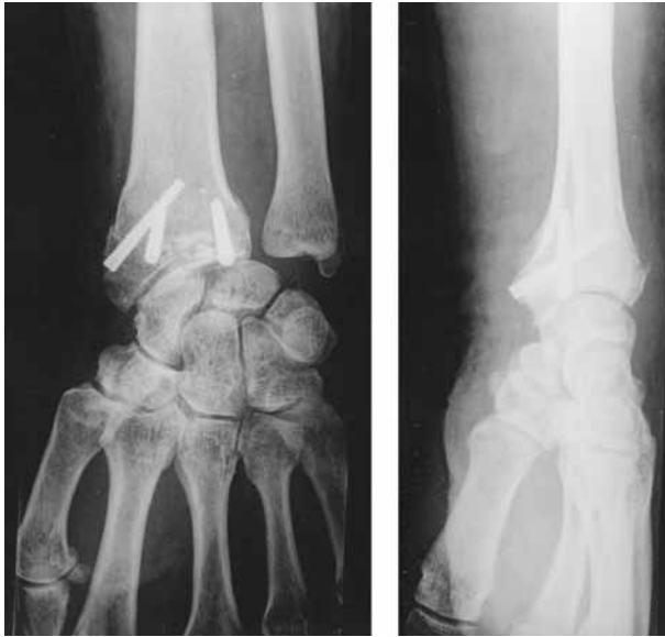
Fig. 2. — Healed fracture at 6 months

minimally invasive technique and does not involve a large exposure or periosteal stripping. The wrist can be mobilised early; therefore the risk of post-traumatic stiffness is minimised. There is minimal chance of infection and the screws are buried in the bone hence there is no need for removal of implants.