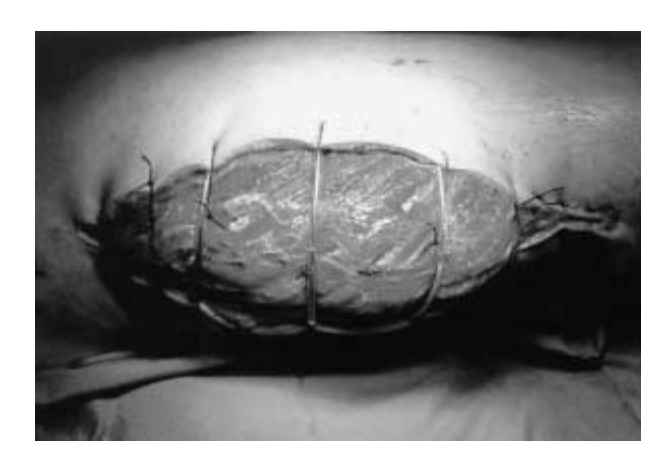
Fig. 3. — Lateral view of the thigh 4 days after fasciotomy. Note the drains in contact with the vastus lateralis in the middle of the wound and simple skin sutures at the edges of the wound. This technique involved running the blue polyamide monofilament decimal 4 Peterlon inside wide drains placed in contact with the muscles and then sutured on the skin. These drains (4-mm wide) permitted an increase in the contact area between sutures and muscles and avoided damage to these muscles.

Daily tightening of the shoelace permits gradual reapproximation of the skin edges until complete closure is attained. Closure is then possible in 5 to 10 days. The advantages over split-thickness grafting include avoidance of donor-site morbidity and better cosmesis. This technique is useful for fasciotomy wounds on forearms or legs, but may appear to be less adapted to close a fasciotomy on the thigh as in our case. Skin retraction was too important (more than a 10-cm gap) and a vessel loop would not have withstood the tension generated by soft-tissue swelling. We therefore used a modified protocol for fasciotomy wound management. Simple skin sutures (Peterlon® blue polyamide monofilament decimal 4) were progressively tightened every two days until closure of the skin defect. To avoid the risk of damaging muscles, especially the vastus lateralis, the polyamide monofilament sutures were run inside wide drains placed in contact with the muscles and were then sutured over the skin. These 4-mm wide drains enlarged the contact area between sutures and muscles, preventing damage to muscles (figs. 3, 4). Closure without skin or muscles lesions was possible after 15 days and 7 dressing changes (fig. 5).