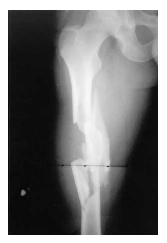
Fig. 1. — Radiograph showing a comminuted fracture of the middle third of the right femur in a 19-year-old man.

the thigh was made, and fasciotomy of both the anterior and posterior compartment was done through a lateral incision, as described by Tarlow et al. (10): the skin incision extended from the intertrochanteric line to the lateral epicondyle, the anterior compartment was opened by incising the fascia lata, the vastus lateralis was retracted medially and the lateral intermuscular septum was incised, decompressing the posterior compartment. On incision of the fascia lata, the vastus lateralis bulged and appeared edematous, but the muscles appeared viable and contracted on stimulation. The creatine phosphokinase level peaked at 50,000 IU on the third postoperative day, but all the muscles appeared viable and of a normal color. Biological and clinical outcome were progressively favorable. The problem was closing the fasciotomy.