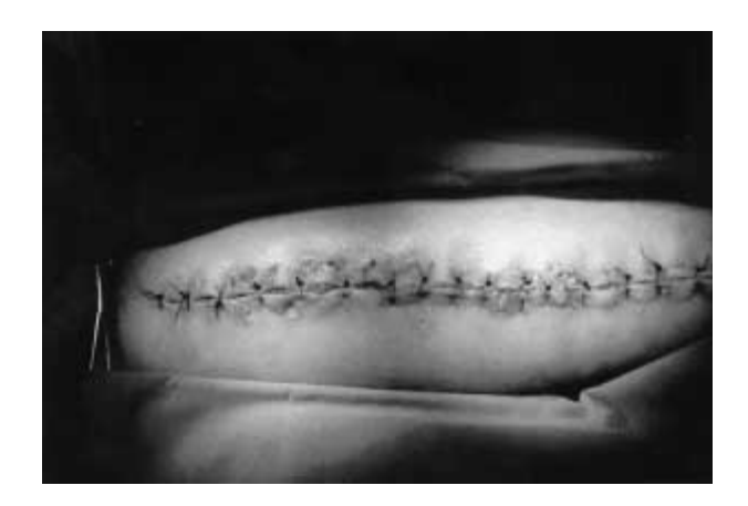
Fig. 5. — Complete closure of the wound after 15 days