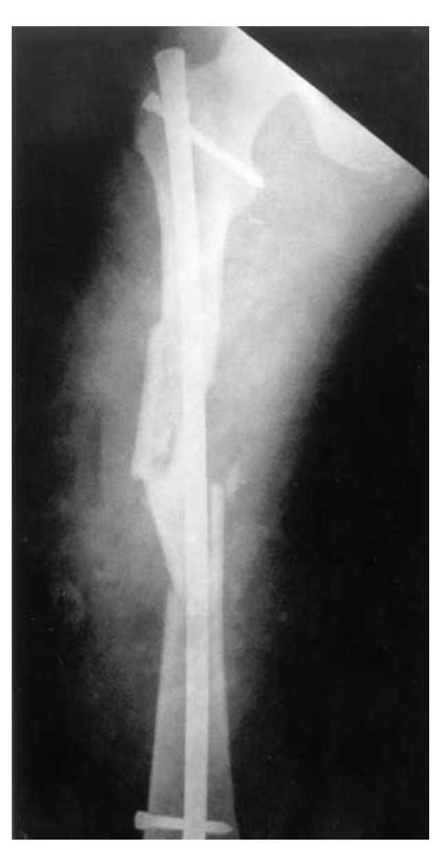
Fig. 2. — Radiograph showing intramedullary nailing of the femur in the same patient.

the thigh was made, and fasciotomy of both the anterior and posterior compartment was done through a lateral incision, as described by Tarlow et al. (10): the skin incision extended from the intertrochanteric line to the lateral epicondyle, the anterior compartment was opened by incising the fascia lata, the vastus lateralis was retracted medially and the lateral intermuscular septum was incised, decompressing the posterior compartment. On incision of the fascia lata, the vastus lateralis bulged and appeared edematous, but the muscles appeared viable and contracted on stimulation. The creatine phosphokinase level peaked at 50,000 IU on the third postoperative day, but all the muscles appeared viable and of a normal color. Biological and clinical outcome were progressively favorable. The problem was closing the fasciotomy.