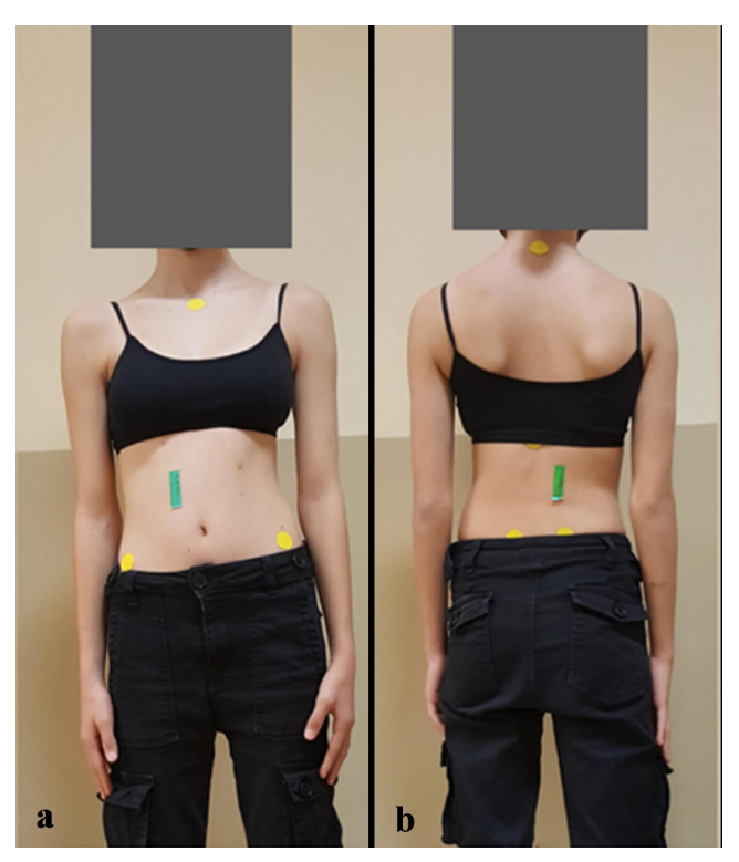
Figure I. — a) Photogrammetric evaluation for the measurement of anterior trunk symmetry, b) Photogrammetric evaluation for the measurement of posterior trunk symmetry.

The measurement of ATR was performed with the scoliometer Adam's test. The patient's feet are 15 cm apart, knees are tense, shoulders are loosely bent forward, the scoliometer is placed on the curve apex and the measured rotation degrees are recorded<sup>16</sup>.