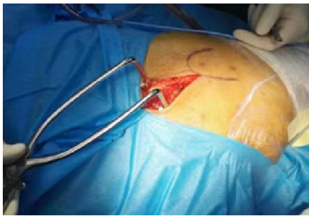
Fig. 1. — Skin incision.