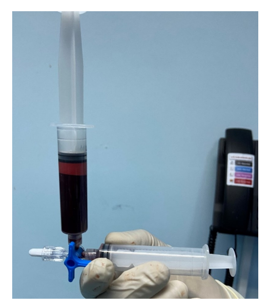
Figure 1. — Bone marrow aspirate after centrifugation.

All procedures were scheduled in the inpatient operative setting and were operated under general anesthesia by the author (MCU). A single dose of second-generation cephalosporin was administered intravenously at induction. We routinely used chemical thromboprophylaxis for 7 days in all cases. Blood