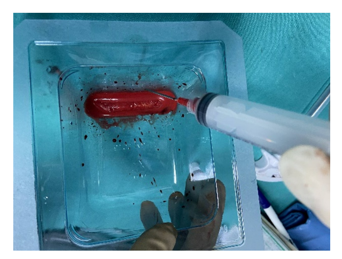
Figure 4. — a) The removed block was kept in BMAC for 5 minutes. b) The hole made by the K-wire is seen in the center of the vertical shaft of the autograft.

hole. Revitalization was attempted by performing curettage with a curved curette (Figure 5). Approximately 10 cc of BMAC was placed into the decompressed and curetted area using a trocar (Figure 5).