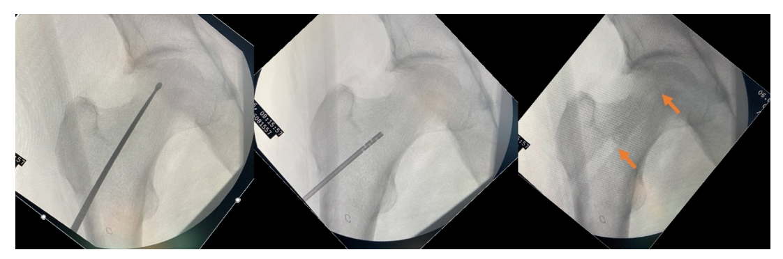
Figure 5. — Curettage of the necrotic region with a curved curette (left). Centrifuged bone marrow extract was applied to the decompressed and curetted area using a trocar (middle). The corticospongious bone block was put back into its place with the help of a mosaicplasty cannula. The arrows show its two ends (right).

Patients were identified from the author (MCU) surgical databases. Between October 2019 and June 2021, 32 consecutive surgically-treated early-stage ONFH patients were screened for this study. The medical records of these patients were reviewed retrospectively. Only 18 patients treated with autologous bone plug-sliding and BMAC injection were included in the study. Plain radiographs of the bilateral hips in the anteroposterior and frog-leg lateral positions, as well as MRIs, were performed for all patients. The diagnosis of ONFH was based on clinical history and radiographic lesions in the femoral head.