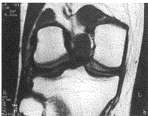
Fig. 1. — A 26-year-old man with a knee that blocked in flexion without instability.

A) High signal intensity ganglion cyst of nearly 38-mm diameter, located in relation with the PCL in a sagittal T2-weighted MR image.