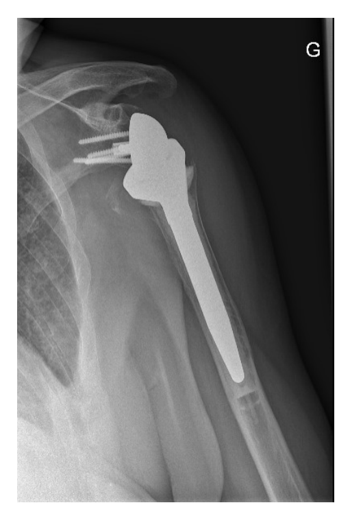
Fig. 2 — X-ray showing a well fixed cemented rTSA.