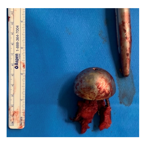
Fig. 5 — glenoid component after explantation (with bone attached to the implant).

results can be inconclusive. Osteoarticular tuberculosis originates from hematogenous seeding of mycobacteria from the primary pulmonary lesion to where blood supply is best. Active disease can arise from latent tuberculosis years later. One could wander why the infection appaered in the shoulder joint and not, in larger, weight bearing joints (80% of cases)<sup>7</sup>. One hypothesis could be the trajectory and proximity of the MT from the pulmonary ganglions to the axillar region but further studies have to prove this because joints are rarely involved by direct seeding but rather as a consequence of adjacent tuberculous osteomyelitis .