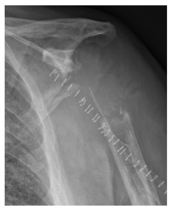
Fig. 4 — AP Xray of left shoulder showing glenoid bone loss.