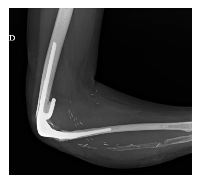
Fig. 3. – Total elbow arthroplaty perfomed in case 3 after vascularized fibula graft resorption. The prosthesis is fixed at the level of the humerus and in the diaphysis of the radius.

to the hospital (17-19). All patients reported here had pathological fracture. Our first case presented with humerus fracture, the other two patients had fractures of ulna and/or radius. Neurogical manifestation as a severe motor deficit due to spine deformity can also be encountered (5,14). Other symptoms include dyspnea particularly in patient with chylothorax (6,14,20). The first patient reported here was admited with respiratory distress and pleural effusion corresponding probably to chylothorax. Sometime the fracture can be associate to swelling of the affected limb due to the lymphatic stasis, as demonstrated in Case 2 by a lymphography with Tc 99. The fracture can heal in time or not. Although Cases 1 and 2 evolved to nonunion, bone callus was however present on radiographs. The refractures may be caused by the progressive osteolytic changes (21,22).