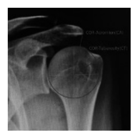
Figure 1. — Radiographic film show measurement of distance from COR to Acromion (CA) and COR to tuberosity (CT); ATD=CA-CT, ATI=CA/CT.

ATI and ATD were measured on true AP radiograph with the patient in standing. The center of rotation (COR) was determined by picture archiving and communication system tools (PACS). First, a best-fit circle was drawn on the native humeral head. Second, perpendicular diameter lines were drawn, and their intersecting point was marked as the COR (Fig. 1).