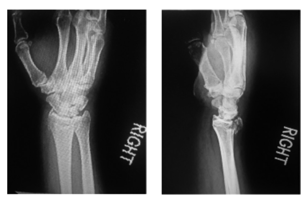
Fig. 1. — Oblique and Lateral Wrist X-rays showing examples of AO type B sheer fracture that was indicated for lower-profile dorsal plating

This study was approved by our institutional review board. Between October 2004 and November 2015 more than 800 patients who sustained a distal radial fracture presented to our institution. This population was retrospectively examined and all patients who were treated with a dorsal locking plate were extracted for this study. The indications for use of a dorsal locking plate were significant dorsal comminution, delayed presentation, dorsal shear fractures and/or concomitant carpal injuries (Figure 1). Another indication was for those fractures that presented with dorsal angulation between 4 and 6 weeks post trauma and required takedown of the immature callous. Our first use of a dorsal locking plate was in 2007. Forty patients with a total of 41 distal radial fractures were identified. Exclusion criteria included age less than 18 years, less than 3 months of follow up, incomplete radiographic follow up, and any other concomitant fixation of the