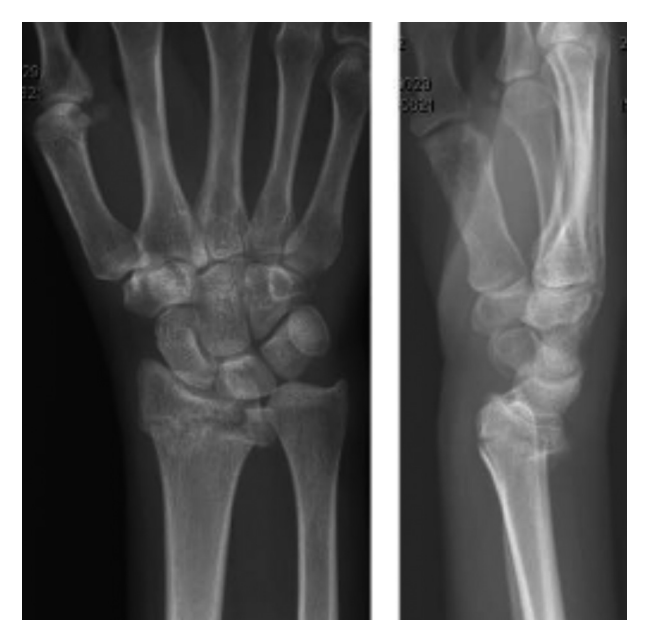
Fig. 5. — AP and Lateral Wrist X-rays showing examples of nascent malunions that was indicated for lower-profile dorsal plating

There are a number of theoretical benefits inherent to dorsal plating. A dorsal approach to the distal radius is straight forward and dissection is easily accomplished. The dorsal approach offers an opportunity to make an arthrotomy and directly view the articular surface (20). An arthrotomy is illadvised using the volar approach; instead, indirect and fluoroscopic techniques have to be used to determine the quality of the reduction. The ability to perform an arthrotomy is also advantageous as it facilitates the treatment of concomitant carpal injuries such as scaphoid fractures and ligament tears. The dorsal approach also allows for dorsal bone grafting to be performed at the metaphyseal defect. This is more important in fractures that are several weeks old, and in osteoporotic bone that might have limited healing potential. When patients present for treatment between the fourth and sixth week, there is typically abundant nascent callus formation dorsally. A dorsal approach allows the callus to be harvested for bone graft, and allows for easier correction of the malunion (Figure 5). Another potential advantage of the dorsal approach is that the posterior interosseous nerve can be identified and resected; by partially denervating the wrist, there may be a decrease in postoperative pain levels. All the potential advantages stated above, however, are theoretical and the real question is whether they will translate into better results