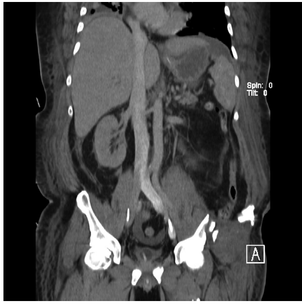
Fig. 3. — Iliac wing fracture with severe displacement and disruption of the abdominal wall

mesh, and some fracture fragments were excised. The patients recovered uneventfully. Two patients were admitted with small bowel injuries and had multiple intra-abdominal abscesses and several reoperations. In one of the patients with small bowel injury, enterocutaneous fistulae developed, and the patient was treated with prolonged IV nutrition and resection of the fistulae after 3 months. In both patients, fracture fragments were the cause of the bowel perforation. Fig. 3 shows a CT image of a patient with severe displacement of the iliac wing fracture and disruption of the abdominal wall.