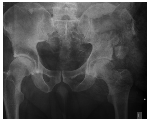
Fig. 2. — Comminuted isolated iliac wing fracture

Of these 6 patients, 2 had an evisceration of the small bowel through the fracture site. All patients were treated with antibiotics, debridement in the OR and, if necessary, closure of the abdominal wall (either primarily or with a vacuum-assisted closure