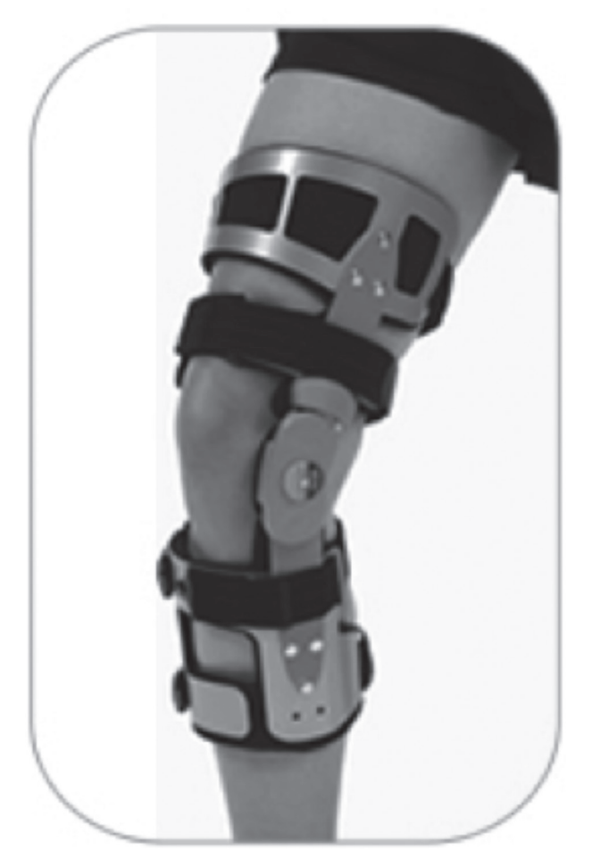
Fig. 2. – Bledsoe Thruster Brace