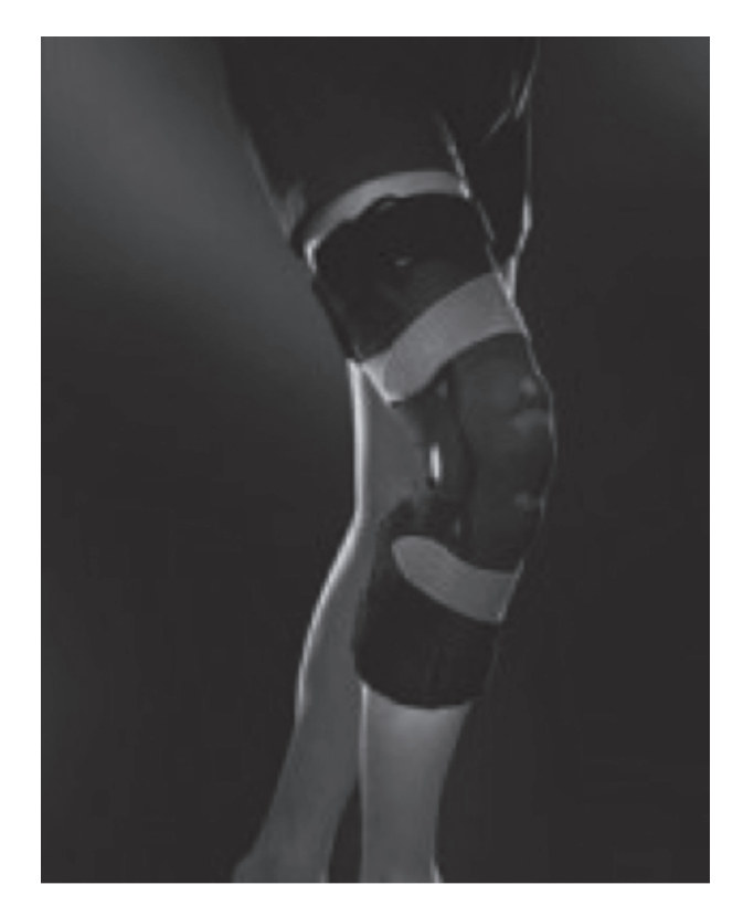
Fig. 3. — SofTec OA brace

The sample size calculation was based on a baseline mean score for pain (VAS, 0-10) of 6.0 and a standard deviation SD of 2.2 (2). We estimated that a 1.5-point difference in VAS between both groups would represent a clinical relevant difference. To detect such a difference with two-sided testing ( \alpha =0.05 and power of 80%) 34 patients in each