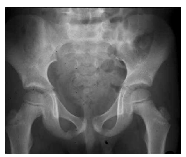
Fig. 1. — Plain film (AP view) of the pelvis shows a normal appearance of both ischiopubic synchondroses, with bilateral well-defined radiolucent swelling aspect, slightly more important on the right side.

moderate contracture of the adductor muscles and a limited passive range of motion of the right hip. C reactive Protein (CRP) value was 41 mg, sedimentation rate (ESR) 55 mm/h, and blood examination was normal. Anteroposterior radiographs of the pelvis showed on both sides a normal appearance