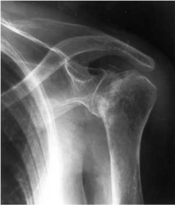
Fig. 1. — Severe omarthritis due to irreparable rotator cuff rupture.

In the preoperative period the mean Constant score was 17.9/100 (range 10/100 to 27/100), standard deviation (SD : 6.01). In all cases pain was the major complaint. It was permanent in five cases with a score of 0/15, and moderate in the other two (5/15).