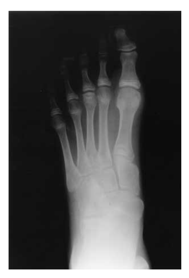
Fig. 9. — Freiberg's infarction. There is flattening and fragmentation at the head of the third metatarsal.

Freiberg's infraction (metatarsal head osteo chondritis). This condition is analogous to Köhler's disease and represents segmented avascular necrosis of the head of a metatarsal, usually the second. It most often affects girls, usually during adolescence. The standard radiographic picture is typical (fig 9).