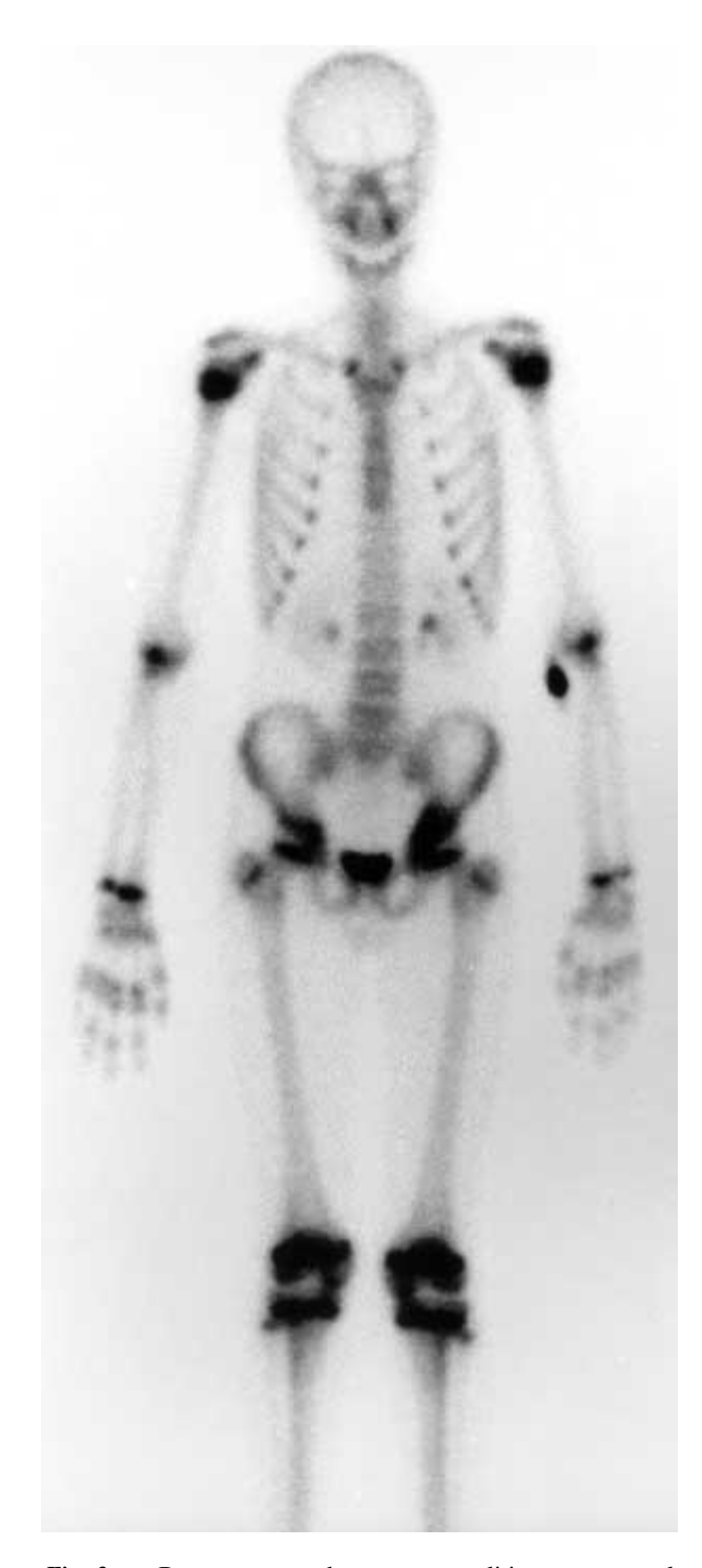
Fig. 2. — Bone scan can detect osteomyelitis at an unusual site. This 2 1/2 -year-old girl was suspected of having an infection of the hip joint. Bone scan shows an increased uptake at the pelvic bone which indicated the correct diagnosis of acetabular osteomyelitis.

Most routine laboratory tests are neither specific nor sensitive but when combined with information obtained from history, physical examination and imaging studies, they can assist in establishing the diagnosis. Laboratory tests are indicated when infection, inflammatory arthritis or neoplasm are suspected. Appropriate tests include a complete blood cell count, ESR (erythrocyte sedimentation rate), CRP (C-reactive protein), and if indicated antinuclear antibody, rheumatoid factor and Lyme titers should be requested. Blood and joint fluid cultures should be obtained when infection is considered.