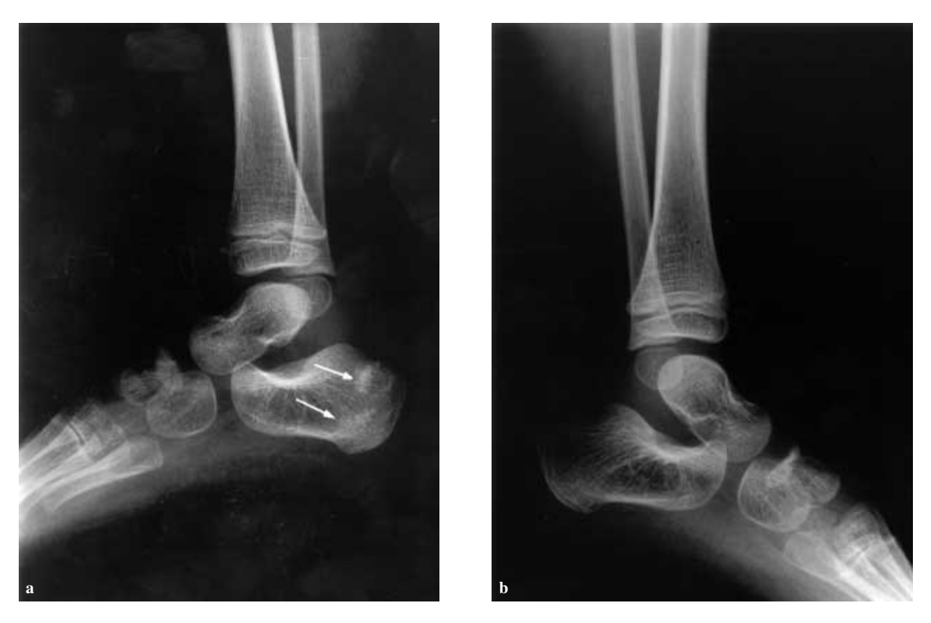
Fig. 1. — Fracture of the right calcaneus in a three-year-old girl. The initial radiograph, at first presentation, was normal. This film (a) taken two weeks later shows an undisplaced fracture of the calcaneus (arrows). Left calcaneus (b) to compare (note sclerosis of the tarsal navicular).

sought. The shoes and the feet should be examined, as limping may be caused by poorly fitted shoes. The foot should be examined for a puncture wound or an ingrown toenail, and the limbs and joints should be examined for painful areas, limited motion, swelling and rashes. A neurological disease may be the origin of limping, and therefore a careful neurological examination including evaluation of muscle strength should be performed. Ask the child to hop and to walk on his heels and toes. These tests permit detection of less obvious muscle weakness and coordination problems. Limited but painless range of motion of joints of the lower limbs may suggest a neurological disorder. The spine should be inspected for a midline dimple or an abnormal hairy patch. If the orthopaedic and neurological examination is normal, the abdomen and genitals should be inspected to rule out appendicitis or torsion of the testis as a cause of limping.