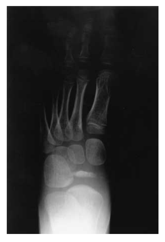
Fig. 8. — Köhler's disease. Flattening and sclerosis of the tarsal navicular are diagnostic.

Growing pains are characterised by pain late in the evening or that wakes the child from sleep, but the child is completely asymptomatic in the morning.