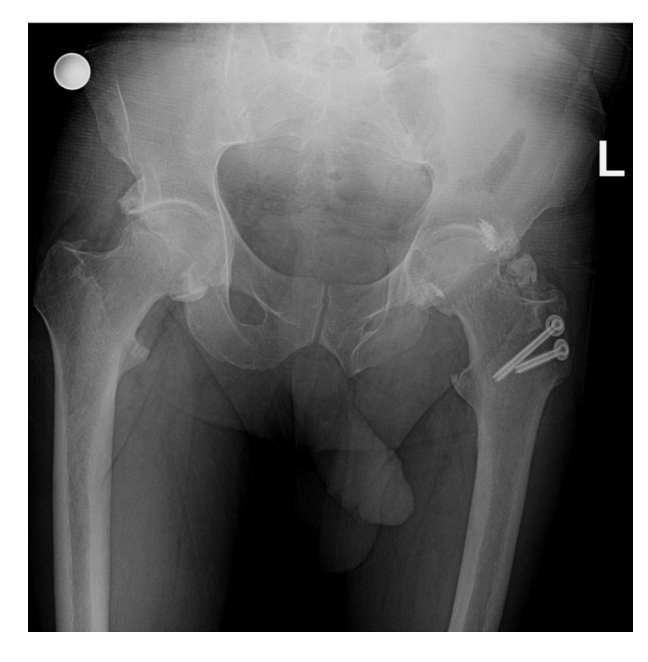
Fig. 3. — Pelvis AP radiograph of a 50 years-old male patient from our series, representing Grade III HO according to Brooker classification.

Brooker classification of HO at hips; 13 cases (68,6%) were evaluated as Grade I (7 male, 6 female), 5 cases (26%) were Grade II (all male) and a case was (5%) Grade III (male). Two of Grade II patients and a Grade I hip had labral repair surgery due to FAI. Another case that required labral repair was not developed HO.