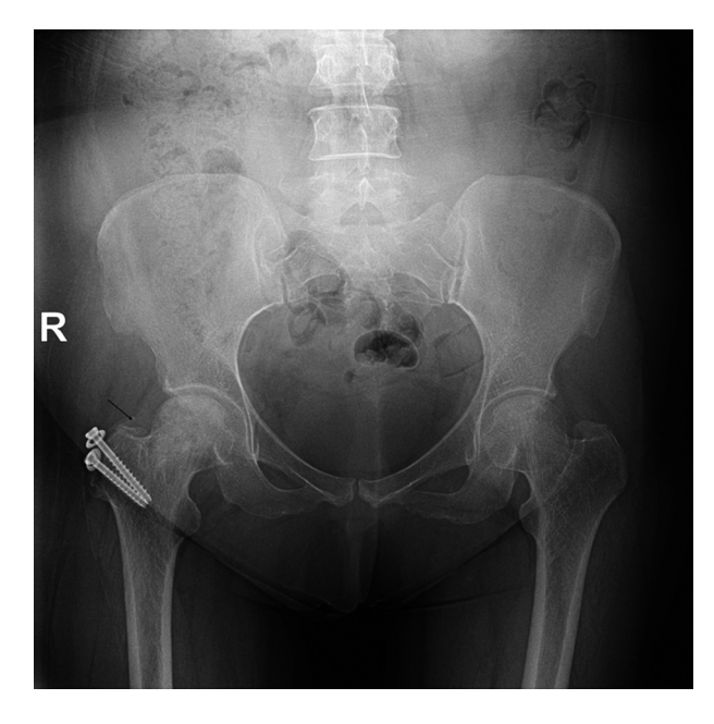
Fig. 1. — Pelvis AP radiograph of a 46 years-old female patient from our series, representing Grade I HO regarding Brooker classification.