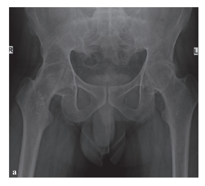
Fig. 2a. — Pre-operative X-ray with Ankylosing Spondylitis both Hip.