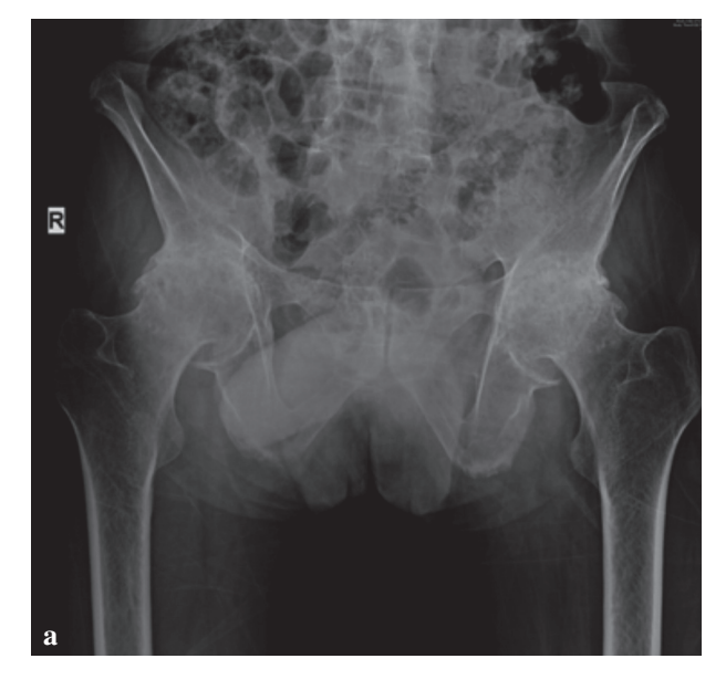
Fig. 1a. – Pre-operative X-ray with osteo-arthritis of both hip.