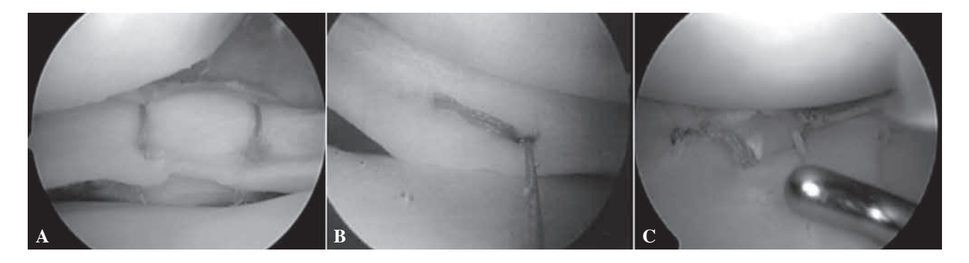
Fig. 1. — Intraoperative arthroscopic views. (A) Vertical mattress suture configuration. (B) Horizontal mattress suture configuration. (C) Vertical and oblique mattress suture configuration.

If the patient had a concomitant ACL injury, arthroscopic reconstruction was conducted immediately after the meniscal repair.