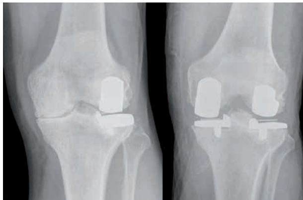
Fig. 3. — 8.5 years after lateral uni when aged 53, a tennis and squash player returns for a medial uni. 7 months postop, the patient now aged 62 has an OKS of 39 and is playing squash. The registry records this as a failure.

Yet a bearing that is worn out, only ever wears out if it feels good. The TKAs of the last 30 years all have had substantial wear rates, as the contact area has been pretty small. Wear is predicted and inevitable. It should not be considered a failure, just the result of having a good life. Surgeons who report series of total knees, using old polyethylene, with no wear need to look at their patients and their operative skills. An active person with a total knee, who wore out their own knee already once, is highly likely to do the same to the artificial knee, unless it is so stiff and uncomfortable that the patient has not been able to use it. Here is one further wrinkle: once a bearing has worn down by one or two millimetres, the joint starts to become unstable. By being a good doctor, if the surgeon fixes that, simply exchanging the bearing, as one would caring for a car, or bicycle, then he or she runs the risk of becoming an outlier. By fixing a problem, it is a failure, by leaving it to disrupt the bone implant interface and provoke a real problem is the successful strategy according to the NJR.