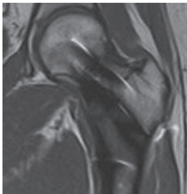
Fig. 2. — Two-year post-operative MRI scan (T-2 weighted, coronal view, left hip) with Targon FN Implant in-situ showing no evidence of avascular necrosis and full union.

The device provides several design advantages over the established methods of either multiple parallel screws or a sliding hip screw, which would be beneficial for surgical treatment of stress fractures