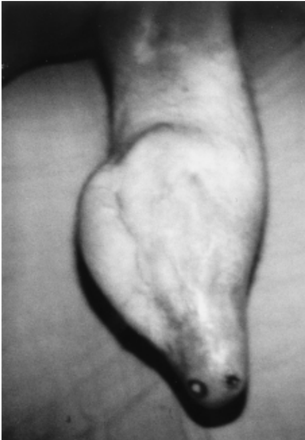
Fig. 4. — Wrong indication for tibial stump lengthening : insufficient soft tissue coverage with ulceration, finally necessitating knee desarticulation.

tibial lengthening) but was unsatisfactory in one tibial lengthening due to knee stiffness, repetitive skin breakdown and ulcerations, finally requiring knee desarticulation (fig. 4).