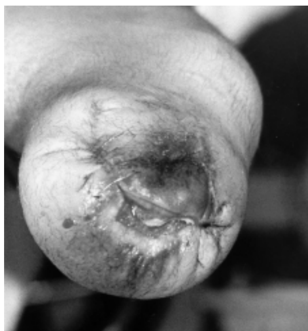
Fig. 1. — Recurrent infection and wound problems are the most frequent causes for reamputation, finally resulting in a very short stump.

soft tissue and bone, is often the only device usable in short amputation stump lengthening (2).