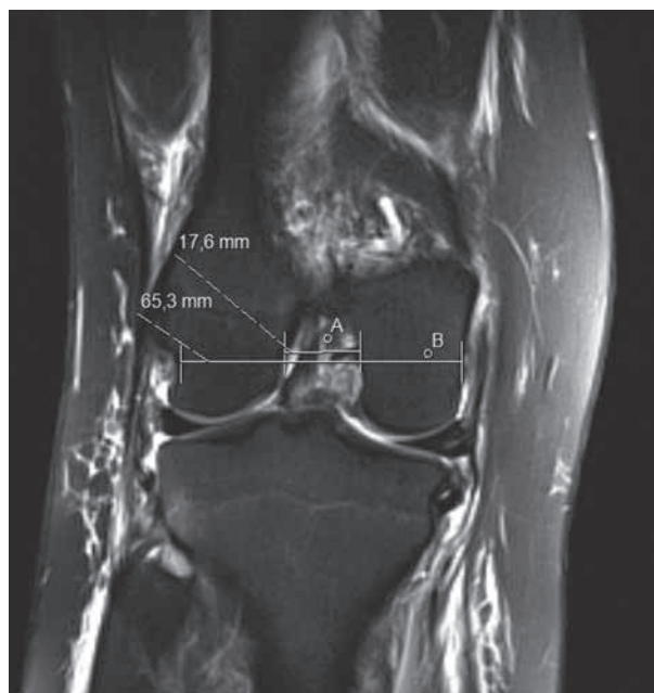
Fig. 1. — NWI is the ratio of the intercondylar notch to the width of the distal femur at the level of the popliteal groove.

All patients had MRI of the knee. The MRI scans were performed supine with the knee extended. The examina-