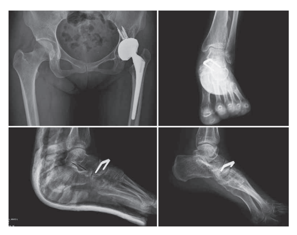
Fig. 3. — A 28-year-old woman sustained drop foot after treatment of developmental dysplasia of the left hip with total hip arthroplasty and lengthening of 5 cm (left-upper panel). Drop foot persisted for 2.2 years before anterior transfer of the tibialis posterior tendon was performed. A satisfactory outcome was achieved with a 3.6-year follow-up.

The pathology of drop foot consists of bone or soft tissues, and the latter is further composed of muscles or connective tissues (16,30). The etiologies of drop foot are complex and the treatment methods are various (3,7,10,14,20,31,33). To effectively treat drop foot, the involved pathology and etiology must be carefully investigated before treatment is initiated (9,20). Anterior transfer of the TP tendon to replace the dorsiflexion function of the tibialis anterior tendon is only one of common treatment methods, and unfavorable conditions must be excluded (20,23, 28,33,36)]. Not all patients with drop foot are suitable to undergo TP tendon transfer.