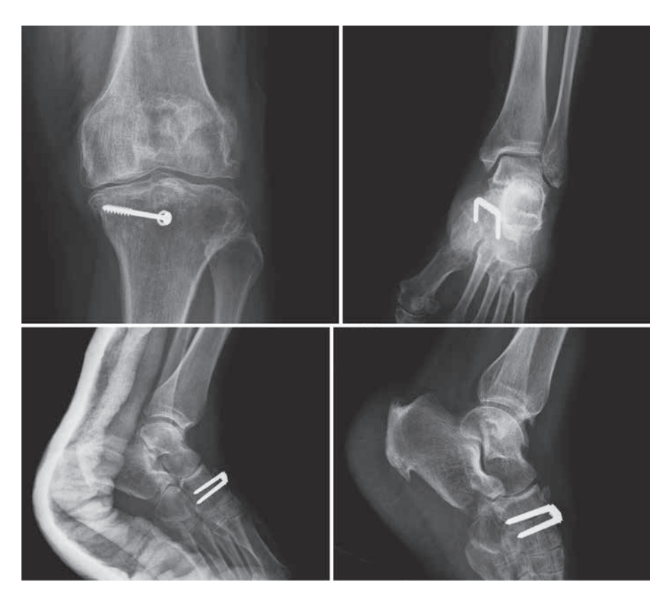
Fig. 2. - A 42-year-old woman sustained a left tibial plateau fracture due to a motorcycle accident (left-upper panel). Left drop foot was noted and persisted for 2.8 years. Anterior transfer of the tibialis posterior tendon was performed, and a satisfactory outcome was achieved with a 4.4-year follow-up.