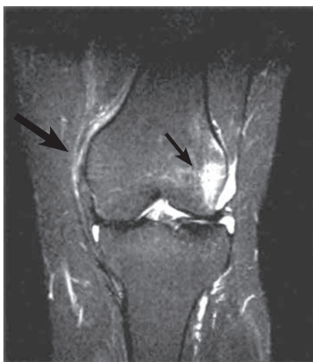
Fig. 1. — MRI study of the left knee reveals complete rupture of the sMCL and dMCL from the femur (large arrow). Bone bruise can be noted on the lateral femoral condyle, suggesting a valgus mechanism (small arrow).

the contralateral knee. Although the patient recalled this sensation as a minor component of his aforementioned episodes of giving-way, he clearly delineated this feature from instability during the valgus stress test.