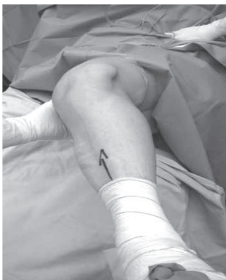
Fig. 2. — Valgus stress test resulting in frank lateral patellar dislocation without applying any force to the patella itself.

the posterior oblique ligament (POL) were clearly identified. Although all three ligamentous structures showed continuous fibers, these ligaments seemed extremely floppy or abundant. According to Hughston (17), the complete medial ligamentous complex was detached from the femur with an L-shaped incision. The femoral end of the MPFL reconstruction was continued by creating a 6 mm bone tunnel starting at the native MPFL femoral insertion which was confirmed by fluoroscopic control according to Schöttle et al (32). The free ends of the gracilis allograft were passed between the two layers of the medial patellar retinaculum and inside the femoral tunnel. With the knee flexed at 60°, the free ends were fixed in the femoral tunnel using a PEEK interference screw (Biosure PK 6 × 25 mm screw, Smith&Nephew, Andover, USA), thus finishing the MPFL reconstruction. The sleeve containing the medial ligamentous complex was advanced proximally and anteriorly on the femur, following the technique described by Hughston (17). In this position, the sleeve was fixed to the medial femoral condyle using two suture loaded bone anchors (Twinfix 5.0 anchor, Smith&Nephew, Andover, USA), thus restoring proper tension in the medial ligamentary complex. The MCL plication