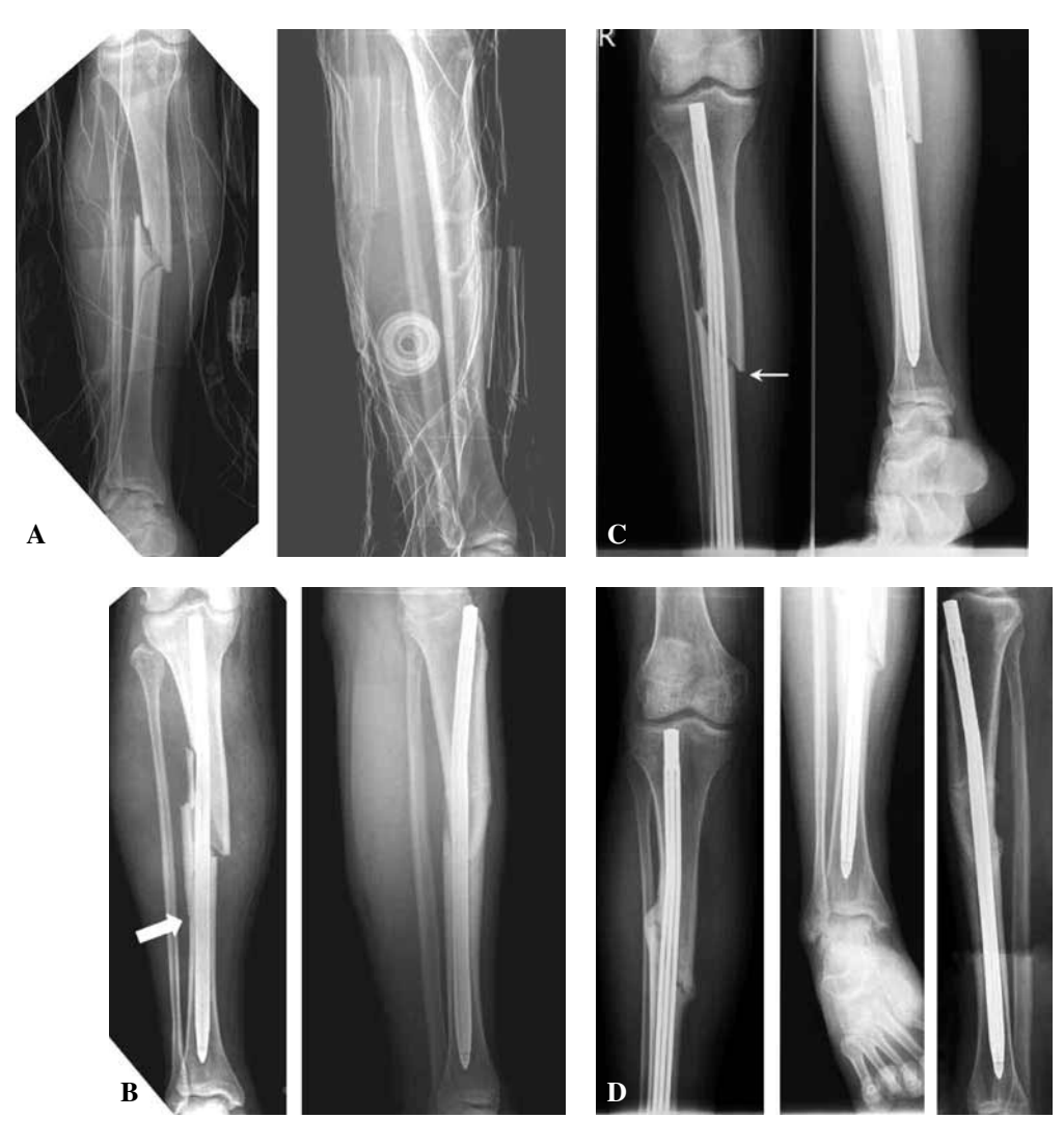
Fig. 3. — (A) : Pre-operative radiograph of a 36-year-old man who sustained a closed, isolated AO type B1 mid shaft (zone II) fracture after an assault. (B) : Post-operative radiograph shows a distal extension of the fracture (thick arrow) which occurred during nail insertion. (C) : Radiograph 6 weeks after nailing showing secondary impaction (thin arrow) of 7 mm. (D) : Radiograph 6 months after nailing showing fracture union.

and before inflation. This simple check can avoid significant malrotation exceeding 10°.