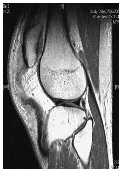
Fig. 9. — Proton density sagittal MR image of a 26-year-old footballer showing rupture of the patellar tendon from the lower border of the patella with displacement of the distal tendon and gross adjacent soft tissue swelling.

9). Classification of injuries can be accurately established with axial images or with GRE T2 sequences (1).