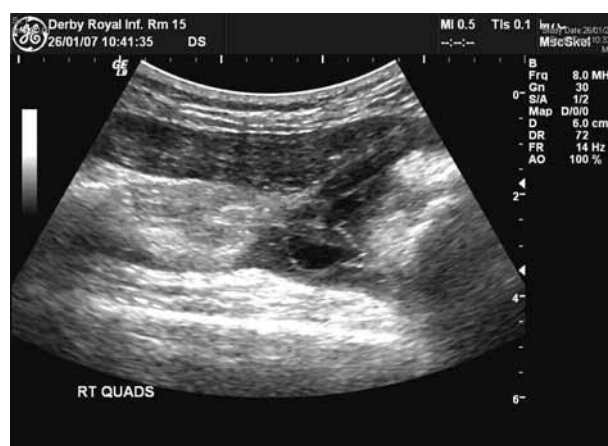
Fig. 6. — A 58-year-old male presented with his knee giving way. Longitudinal sonogram of the right quadriceps tendon shows a complete rupture as an anechoic defect of the quadriceps tendon with a large thigh haematoma extending up over vastus lateralis.

wave penetrance into tissue is inversely proportional to the wave frequency and with greater depth of penetrance, resolution can be sacrificed, limiting its use in obese or muscular patients.