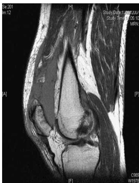
Fig. 8. — Proton density sagittal MR image of a 53-year-old male shows the three layered quadriceps tendon completely transected at the superior pole of the patella. The proximal tendon is completely retracted.