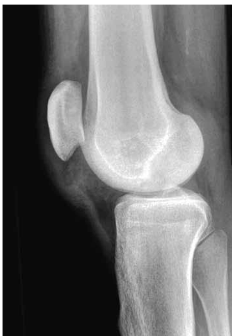
Fig. 3. — Lateral radiograph of a 34-year-old male presenting with hearing a pop in the knee while walking downhill. There is evidence of a large knee effusion with a high riding patella suggestive of a patellar tendon rupture but the diagnosis was missed in initial examination in the emergency department.