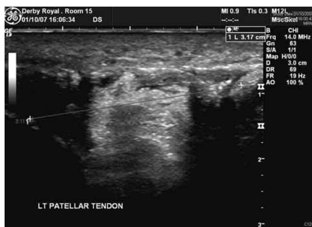
Fig. 5. — A 38-year-old male sustained a twisting injury while playing football. Longitudinal sonogram of the patellar tendon shows a detachment of the distal patellar tendon from the tibial tuberosity with a gap of approximately 3 cm. The arrow represents an artifact also referred to as anisotropy.