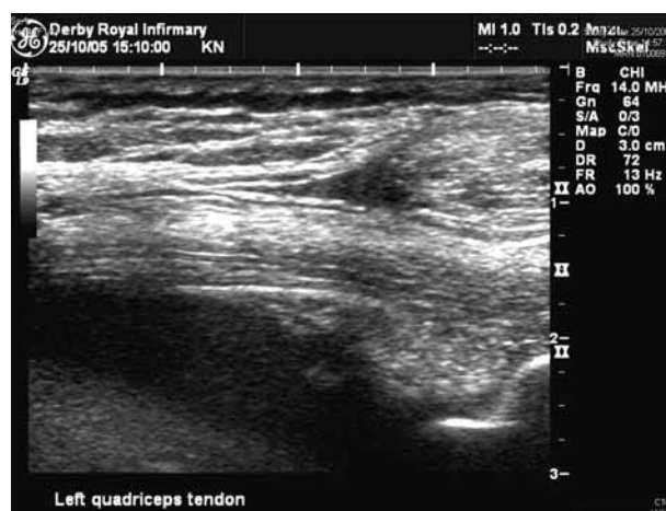
Fig. 7. — A 70-year-old female patient presented with knee giving way. This longitudinal sonogram was reported as follows : left quadriceps tendon appears deficient and lax at the superior pole of the patella. Some fluid is seen at the patella insertion and mixed sonoluent and turbid fluid is seen deep to the quadriceps tendon. This may represent a supra-patellar haematoma. The appearances were reported as indicative of a quadriceps tendon rupture but intra-operative findings showed intact tendon substance.

MRI scan is now widely accepted as the method of choice for evaluation of tendons in other areas, particularly injured tendons (18). The quadriceps tendon is seen as a multi-layered structure showing a laminated configuration. Transection of all layers represents a complete rupture and partial ruptures are seen as focal disruptions of one or more layers,