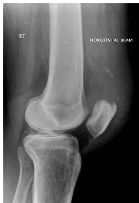
Fig. 4. — A 58-year-old male presented with tripping on ice. There is a very large suprapatellar joint effusion. Note was made of an area of calcification proximal to the patella. This was reported to be an osteochondral body within the suprapatellar joint capsule or an area of calcification within the quadriceps tendon as a result of previous injury. The calcification appears well rounded and may not represent an acute avulsion, but a subsequent MRI scan proved otherwise.

to actively extend the knee and a palpable gap. Despite the clinical signs, misdiagnosis is frequent and reported as ranging from 39% to 67% (7,17). Diagnostic examination may be limited by a large haemarthrosis, active inhibition of movements and preservation of a straight leg raise with use of intact medial and lateral retinaculum or the iliotibial band. As a result, the traumatic rupture of quadriceps tendon is often overlooked. After finding stable cruciate and collateral ligaments, and radiographic absence of a fracture, the patient may be diagnosed and treated as a knee sprain by an inexperienced examiner (15). In addition, partial tendon ruptures and chronic ruptures are more difficult to evaluate thoroughly on physical examination due to absence of palpable gap, and the extensor function, although uncomfortable, may be intact (18).