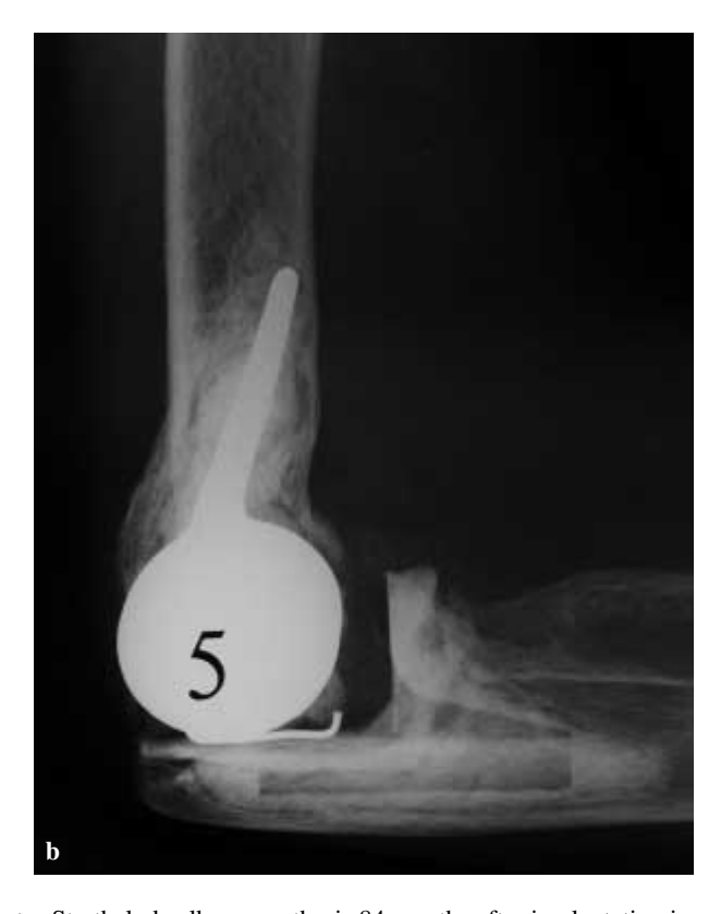
Fig. 2a, b. — Anteroposterior and lateral radiographs showing a Souter-Strathclyde elbow prosthesis 84 months after implantation in a patient with rheumatoid arthritis. Radiolucency is observed around the humeral component. Note the anterior tilt of this component which is typical of loosening.