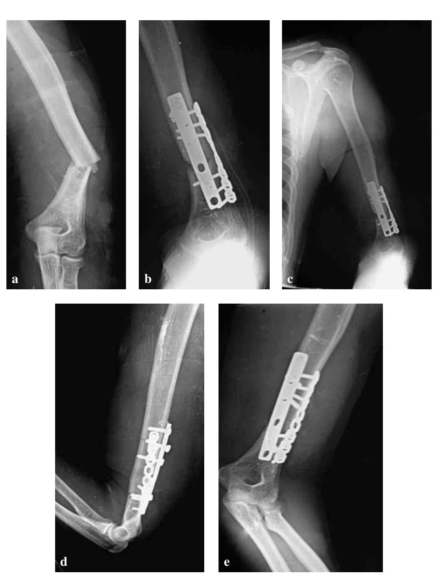
Fig. 1. — Case no 1 : a : preoperative AP radiograph ; b & c : immediate post-op radiograph ; d & e : 31 months after surgery

of such plate with 4.5 screws on the posterior aspect of the narrow lateral column and with thin soft tissue coverage may induce postoperative pain and limit elbow range of motion (10).