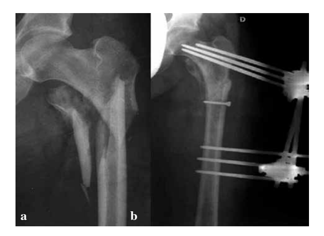
Fig. 1. — a. Comminuted proximal femur fracture (before fixation); b. Comminuted proximal femur fracture (during fixation).