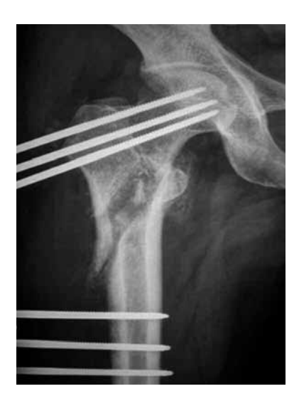
Fig. 3. – External fixation upon patient request (due to religious reasons).

when the patient refused internal fixation or the associated blood transfusion (Fig. 3).