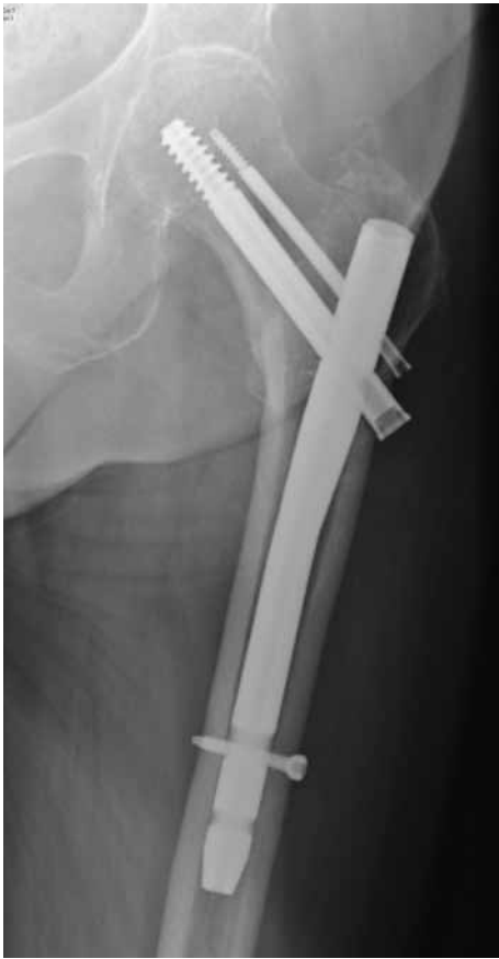
Fig. 2. — ACE Trochanteric Nail

statistically significant difference between the two groups. The same applied to the Merle d'Aubigné subgroup scores.