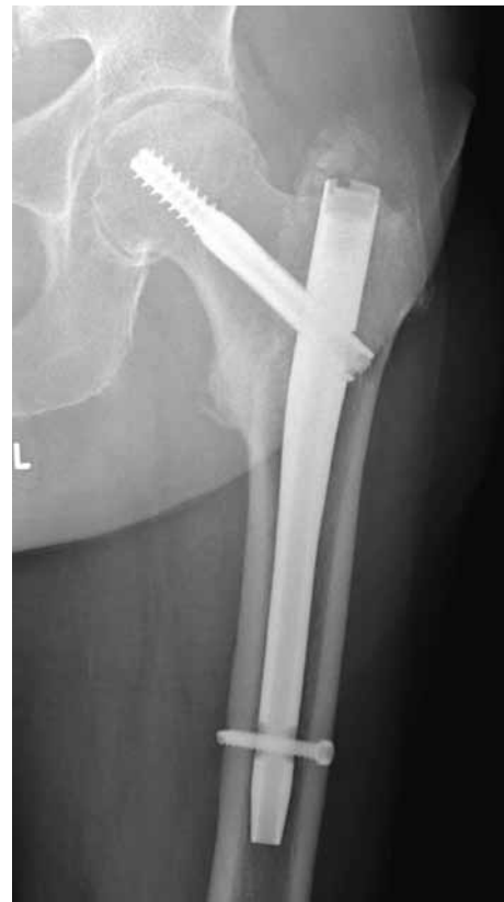
Fig. 1. — Gamma 3-Nail

The preoperative Merle d'Aubigné hip score was 16.42 (SD 2.061) for the Gamma 3 group and 16.06 (SD 2.495) for the ACE group. The mean skin-to-skin operative time was 41 min and 51 min, respectively. No intraoperative technical errors occurred in either group. Six patients were lost to follow-up.