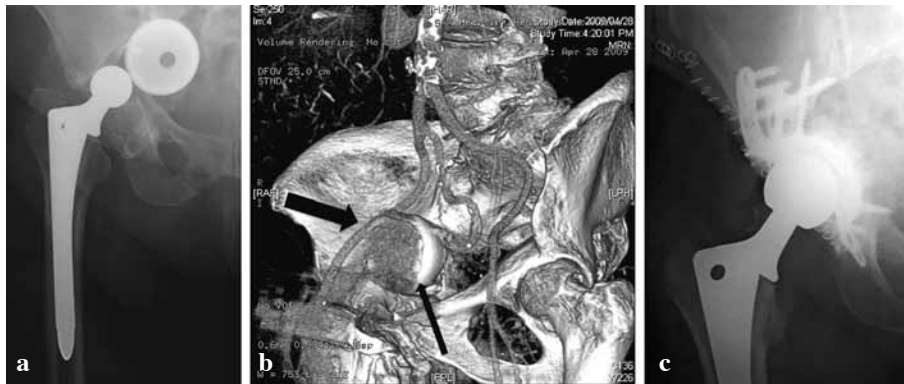
Fig. 1. — Case 1. (a) The socket had migrated beyond the ilio-ischial line. (b) The pre-op CT angiogram revealed the external iliac artery (thick arrow) had been entrapped by the socket (thin arrow). (c) The patient was treated with a cage construct after safe removal of the socket.

positioned in the ischial bony sleeve until sufficient purchase was obtained. Next, the final cage was assembled based on the trial and fixed inside the ischial bone with its inferior flange. The superior flange was fixed to the outer iliac table with several screws. Finally, a polyethylene liner was cemented into the cage with the correct anteversion and inclination angles. The hip approach wound was closed. The retroperitoneal loop was pulled out through the retroperitoneal wound without re-opening it.