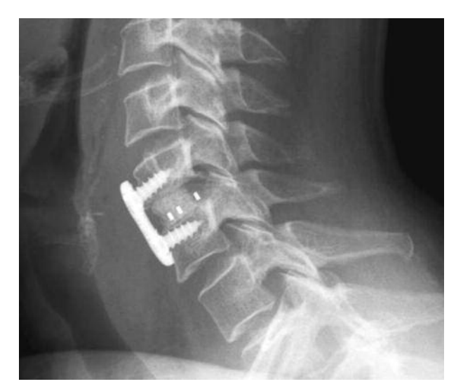
Fig. 3. – Cervical spine antero-posterior and lateral view after anterior cervical discectomy and fusion using a PEEK cage filled with tri-calcium phosphate bone substitute and the Uniplate® system.

screws per vertebral body. The plate is low profile, semi-rigid, 10.5 mm wide, 2.3 mm thick, maintained by a single screw in each vertebra, and secured by a tri-lobe locking mechanism. We asked the manufactor (DePuy Spine) to slightly diminish the diameter of the Caspar pins, in order to make it possible to slide the plate over the Caspar pins, which were then removed and replaced by screws with appropriate length.