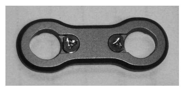
Fig. 1. — Anterior view of the Uniplate® anterior cervical plate.

one-level and even more so with two-level ACDF, significantly enhanced fusion, supporting its use in the treatment of cervical spondylosis. One of the problems encountered with this approach is that the use of a Caspar intersomatic distractor and a classical 4-screws plate requires drilling three holes in each vertebral body. This may weaken the vertebral body and result in a loose grip of the screws. For this reason, the author chose to use a midline plate (fig 1), secured by only one screw per vertebra