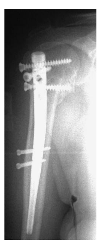
Fig. 2. — Post-operative radiograph at 6 months follow-up, showing healing of the fracture.

unable to undergo surgery or rehabilitation may be treated non operatively (1,35,39). Our surgical treatment guidelines include Neer's criteria, all displaced three-part and four part fractures and those combined with humeral shaft fractures. Fractures with dislocation of the humeral head are preferably treated with hemiarthroplasty, especially in elderly patients (10,13,24,27,30,38).