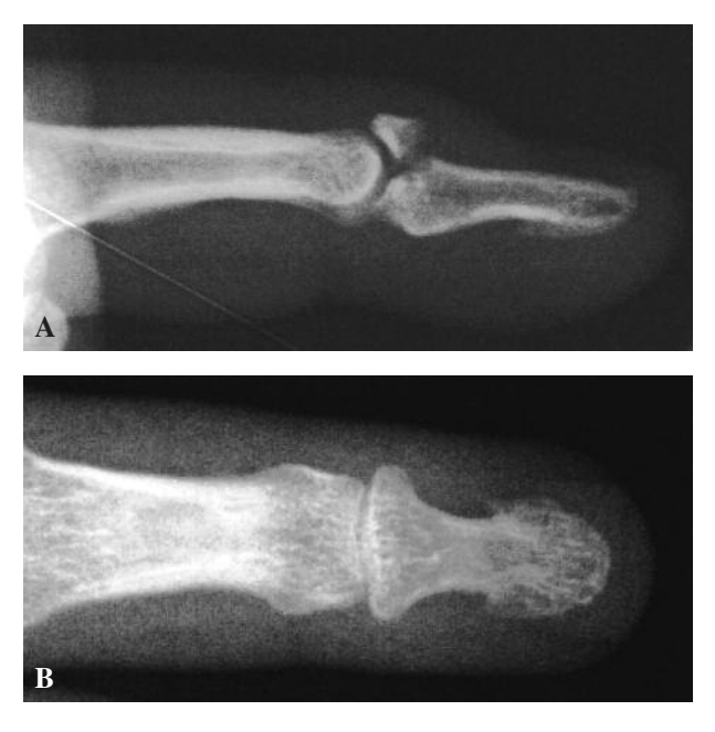
Fig. 2. — Lateral (A) and anterior-posterior (B) radiographs of a mallet fracture with 50% involvement of the articular surface.