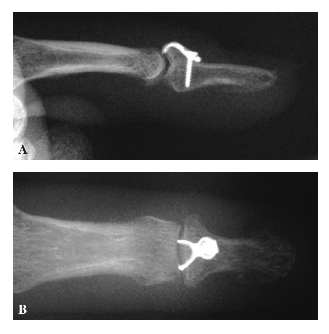
Fig. 3. — Lateral (A) and anterior-posterior (B) radiographs 7 weeks after surgery showing fracture union and hook plate in situ.

rupture, avascular necrosis of the fragment and nail growth disturbance (1). A biomechanical study by Damron et al compared common internal fixation techniques for bony mallet injuries and found figure-of-eight wiring and tension band suturing to be superior to K-wire fixation or tension band wiring (3).