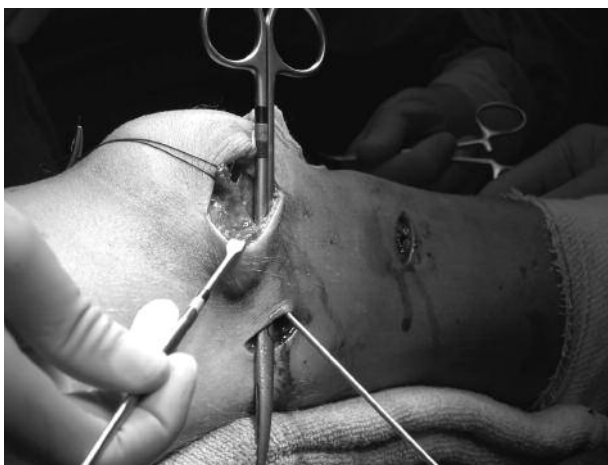
Fig. 4. — Sagittal view from a medial perspective showing the alternative approach with three incisions. The tunnel underneath the medial retinaculum and vastus medialis obliquus is illustrated by the dissection scissors.