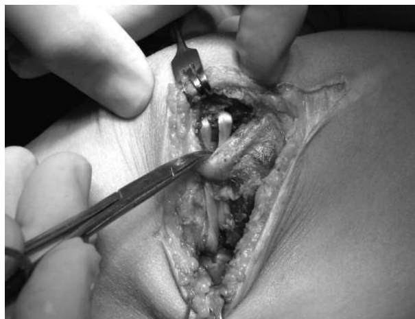
Fig. 5. — Sagittal view from a medial perspective showing the course of the reconstruction graft.

reconstructing the MPFL in 2006 for 12 patients, in which the semitendinosus tendon is looped through an Ethibond loop, which is attached to the patella in a comparable manner as in the technique we used (12,13).