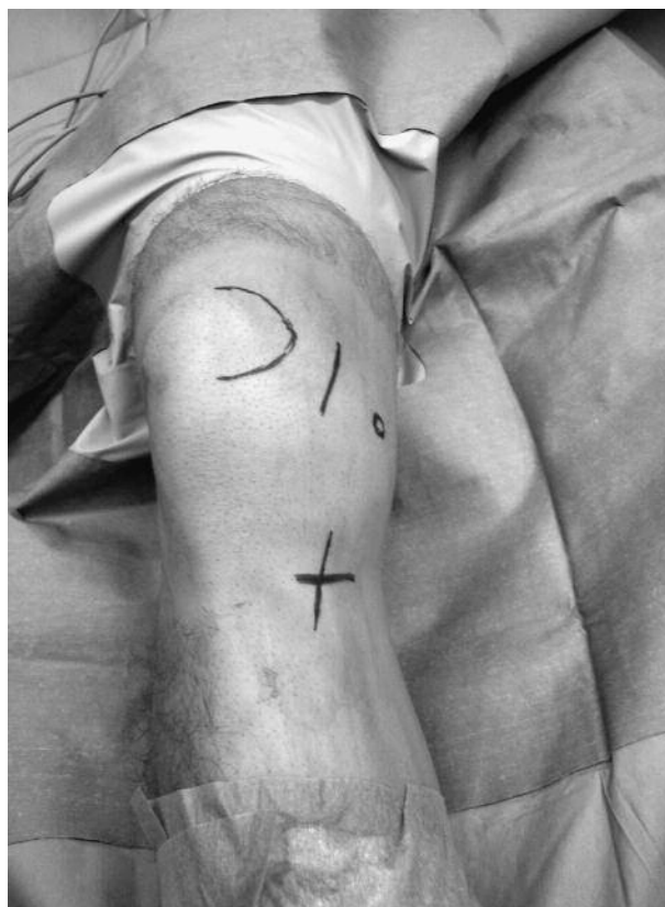
Fig. 3. — Anteromedial view of the skin incisions: one halfway between patella and medial femoral epicondyle and one small obliquely running incision at the gracilis distal insertion site.

autograft, leaving the attachment to the patella intact and turning this graft 90° medially (16). Although they reported ‘promising results’ with this technique and no recurrence of dislocation, we