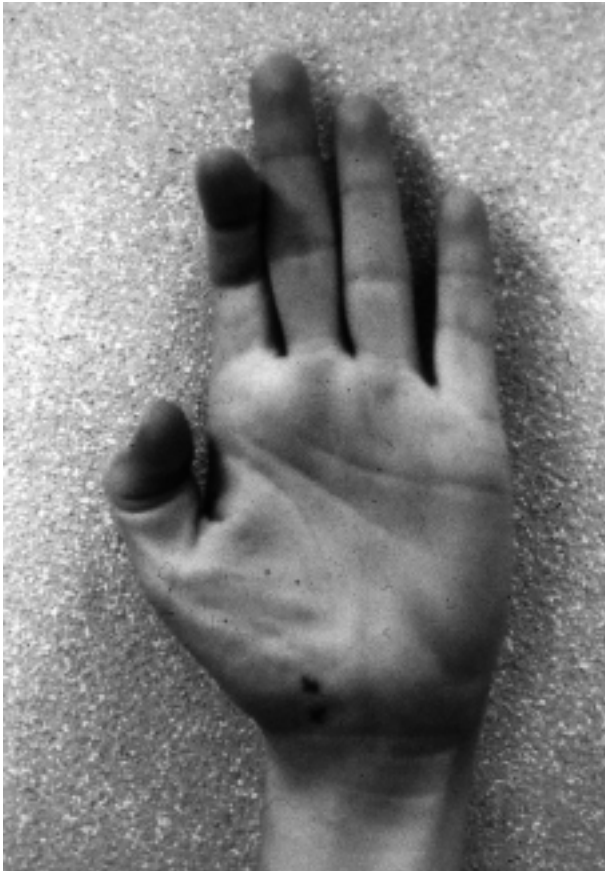
Fig. 1. — Clear demonstration of the patient's simultaneous flexion of the IP of the thumb and the DIP of the index finger. (X) indication of the tender spot.

this connection, independent movement of the FPL and index finger FDP could be demonstrated. Postoperatively, immediate mobilisation of the fingers was encouraged.