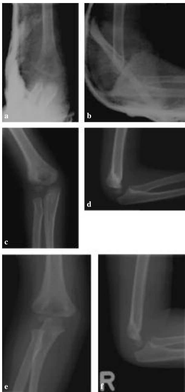
Fig. 2. – Anteroposterior and lateral radiographs 1 week (a, b), 3 weeks (c, d) and 4 weeks (e, f) after the initial injury ; consolidation in anatomic position.