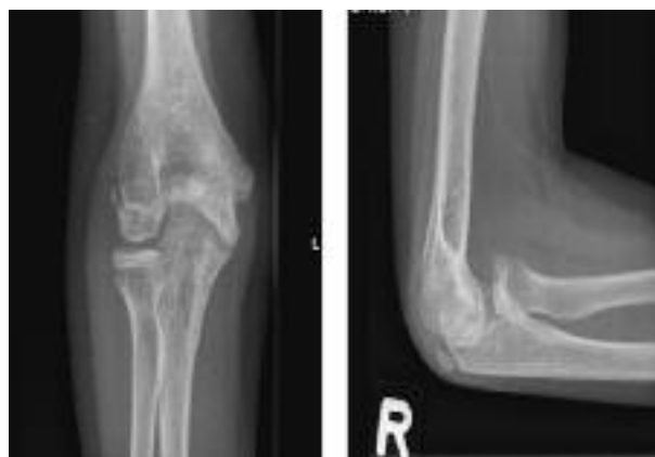
Fig. 3. – Radiograph of the distal humerus with fishtail deformity of the girl 8 years after trauma.

At the age of two, a girl sustained a non-displaced supracondylar fracture of the right humerus (fig 1). It was treated with a cast and controlled with