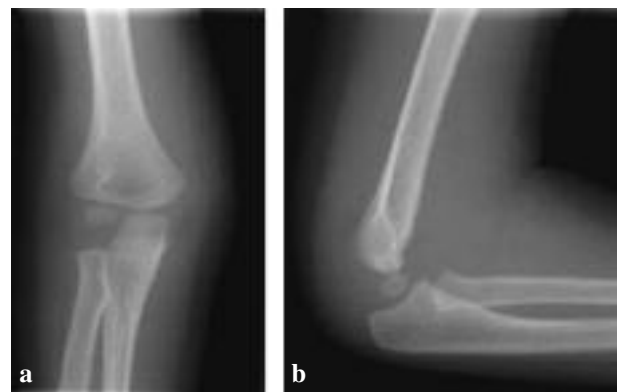
Fig. 1. – Anteroposterior (a) and lateral (b) radiographs of the elbow at time of trauma.

Supracondylar fracture of the humerus is the most frequent type of elbow fractures in children (1). Nonunion of the lateral humeral condyle, cubitus varus, cubitus valgus and fishtail deformity are rare complications of these injuries. Fishtail deformity is a well known complication from radial condyle fractures (7) but have been described as well as a consequence of nearly any fractures involving the distal humerus in children (2). This includes supracondylar fractures, T-condylar fractures of the distal humeral condyles and fractures of the ulnar condyle. The deformity can occur even with absent or minimal displacement of the fracture fragments (5). The fishtail deformity becomes radiologically visible as a characteristic form of the dis-