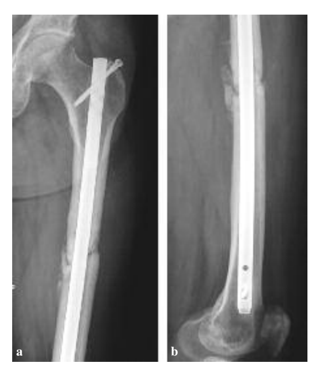
Fig. 2. — Postoperative findings a : AP view, b : Lateral view

A lateral longitudinal skin incision was made along the nonunion site. The cables on the proximal