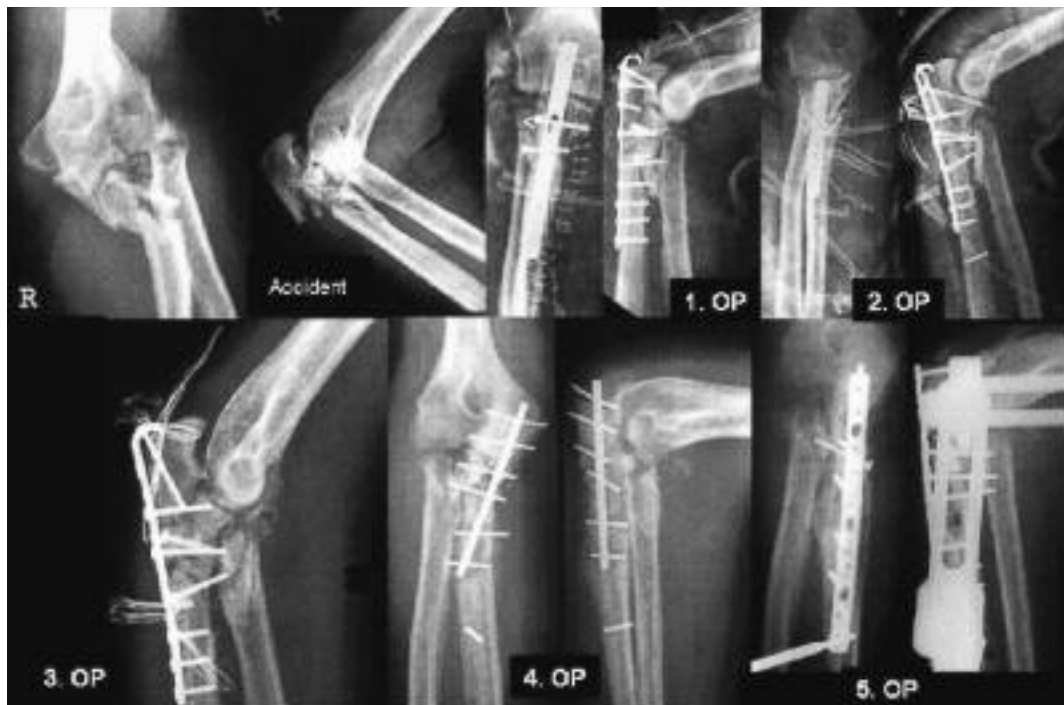
Fig. 3. — Radiographic course of patient No. 5/C, who presented with chronic instability and pseudarthrosis after fracture-dislocation of the elbow.

reduction during the early postoperative physical therapy. The fixator is applied if the patient has proved to be non-cooperative or if the surgeon is unsure about the future patient's compliance. In our group of patients with chronic unstable elbow joints, the clinical behaviour of the patients was