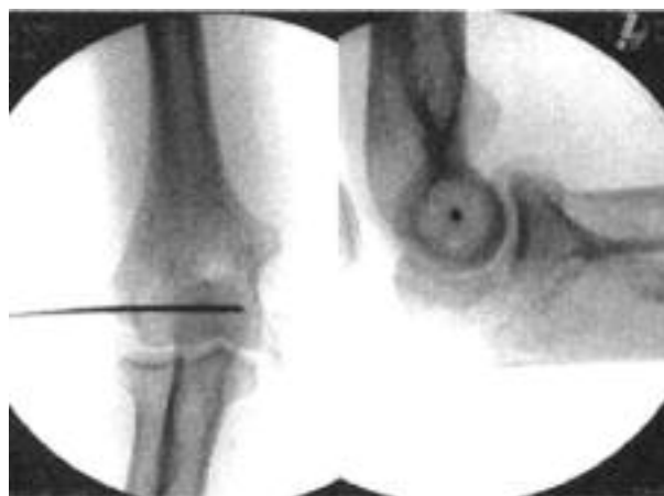
Fig. 1. — The transfixing 2 mm Kirschner wire is supposed to appear as a dot in the centre of the condyles in the lateral fluoroscopic view.

In the group with acute instability, soft tissue damage caused the early removal of the fixator (patient No. 9/A) and in the group with chronic instability we had two cases of pin tract infection (patients No. 4/C and 12/C), one pin breakage (patient No. 8/C) and one breakage of an axis element of the fixator (patient No. 2/C) leading to repeat surgery. Four patients had pre-existing nerve damage (patients No. 1/C, 4/C, 7/C, 10/C); no further nerve compromise related to the application of