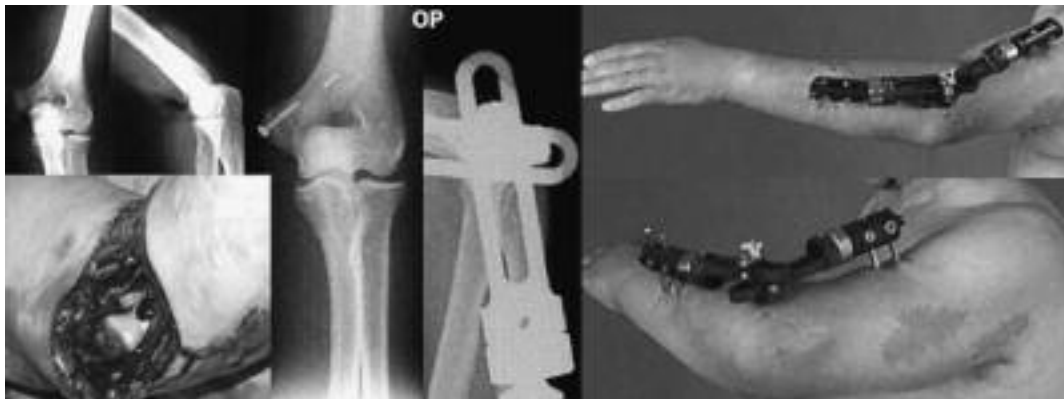
Fig. 2. — Open fracture-dislocation (patient No. 8/A). Post-reduction radiographs, clinical picture and picture after application of the external fixator.