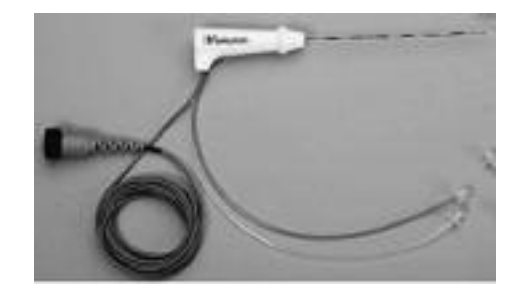
Fig. 3. — Cool-tip RF System electrode

All patients reported complete pain relief, except one who felt persisting discomfort in his thigh. This patient presented a major cortical reaction in the femur after the radiofrequency procedure. In the end he underwent open surgery with en bloc resection of the cortical bone affected, which