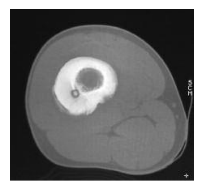
Fig. 1. — CT-scan. Intracortical osteoid osteoma in femoral shaft. We see the nidus with central calcification.

At present, radiofrequency has also been used to treat other bone lesions such as bone metastasis, sacrum chordoma, and others (26).