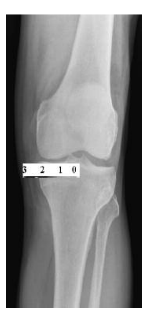
Fig. 2. — Zones of location of mechanical axis on the tibial plateau (zones on unreplaced compartments represented by negative values).

The mean follow-up was 10.8 years (range 2 to 17). The mean age at follow-up was 71.3 years (range 56 to 81 yrs). The mean total Bristol knee