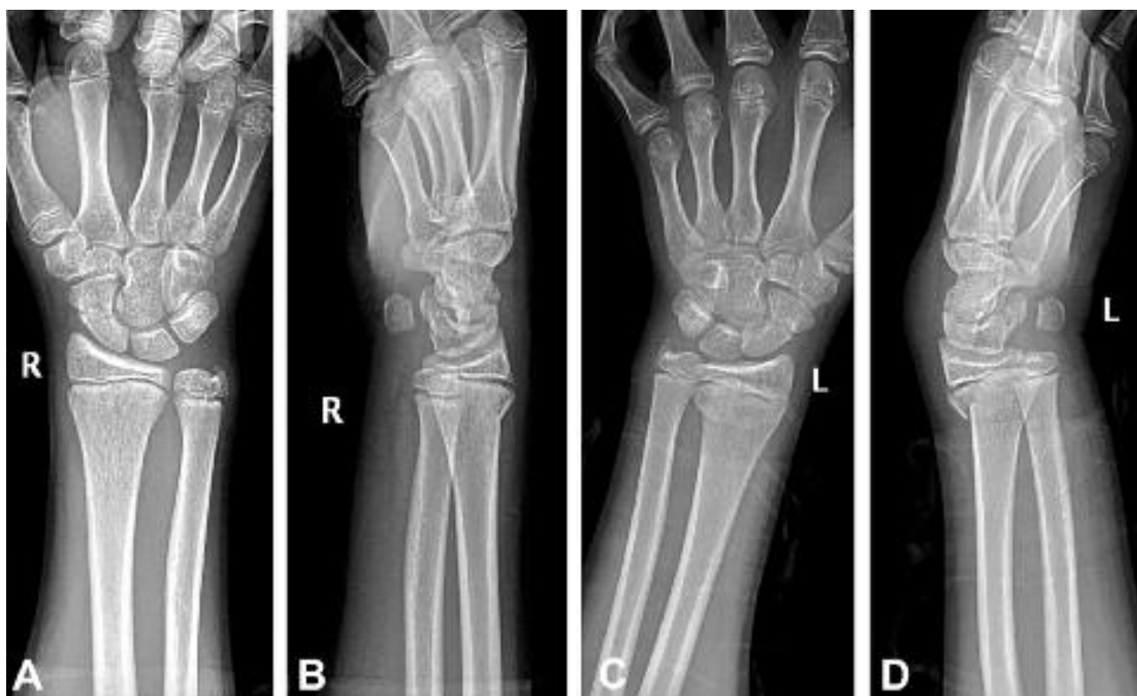
Fig. 1. — AP and lateral radiographs of the right (A, B) and left (C, D) wrist at the time of injury. A Salter-Harris type II fracture of the distal radius can be seen on both left and right side. The fracture of the left wrist is more dorsally displaced than on the right side. The midscaphoid bilateral fractures can also be seen (A, D).

our hospital. He complained of local pain and deformity of the distal end of the left forearm and pain in the right wrist. Clinical examination revealed swelling over the dorsal aspect of the left wrist and discoloration. The right wrist was less swollen, but there was a blue discoloration on the dorsal side. No obvious deformity was seen on the right forearm. Both wrists were tender to palpation and had decreased range of motion. The neurovascular status was normal. No other injuries were found. Anteroposterior and lateral radiographs of the wrists showed displaced Salter-Harris Type II fractures (11,16) on both sides (fig 1). The fracture of the left wrist was more dorsally displaced than on the right side. A nondisplaced transverse midscaphoid fracture was seen in both hands (fig 2). The fractures were in good position and were immobilized with a cast below the elbow including the thumb (scaphoid cast) on both arms for 6 weeks. The conservative treatment was inconven-